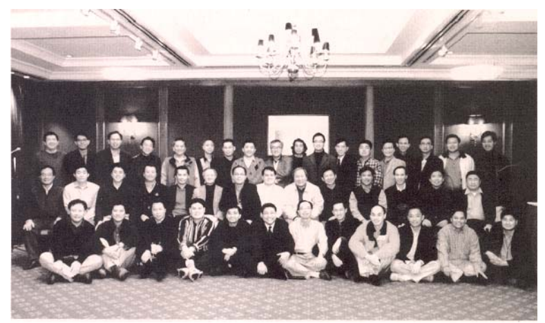
Group Photo of Class 75