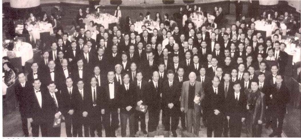
LSCO8A Christmas Ball 2000 Lasallians group Photo