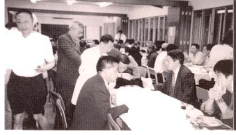
During the Vote-Counting; the Old Boys had their buffet dinner at the General Purpose Room.