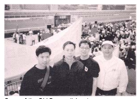
Some of the Old Boy participants

At 9:30a.m. on March 2, 2003, large crowds of Hong Kong citizens were present at the Hong Kong Jockey Club Shatin Racecourse. Among them were some La Salle Old Boys who also took part in the 2003 New Territories Walk which is supported by the Community Chest. All donations generated by this Walk will be channeled to enhance and improve the "services for the Disabled" The lively opening ceremony included cheers by the guests from all walks of life to the participants and a call-over of individual team including LSCOBA who was complimented for taking part and financially supported the needy.