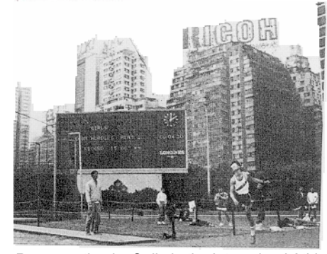
Representing La Salle in the Interschool Athletic Meet 1989.