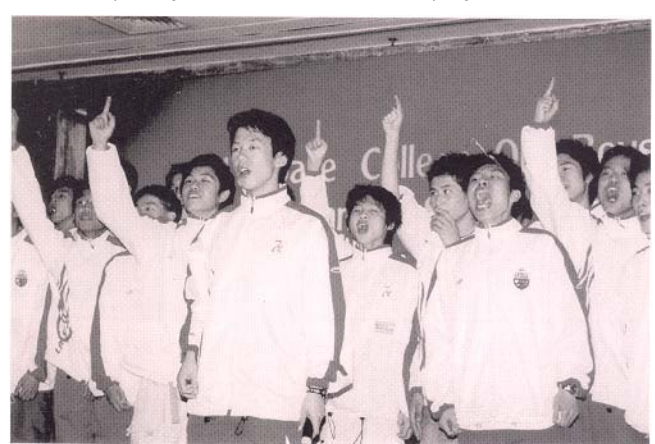
We won the Overall Champion again (459:421) and Champions in B (159:114) & C (161:122) grades in the Interschool Athletic Meet at Wanchai this year: The Athletes are cheering at the top of their voices.