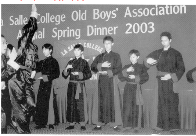
It's Kung Fu Dancing