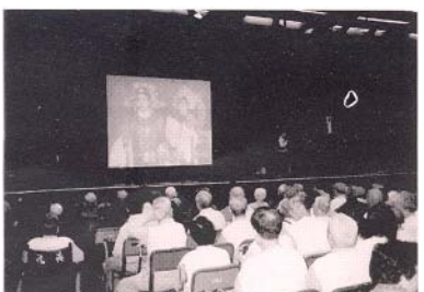
The Chinese opera