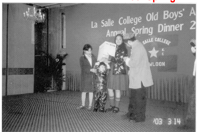
The cute raffle draw winners