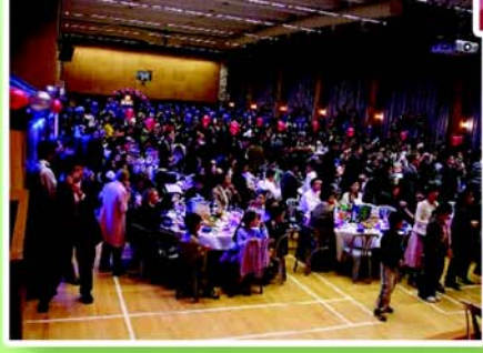
100 Fund-raising tables takes place at the LSPS Spring Carnival - 27th March, 2004