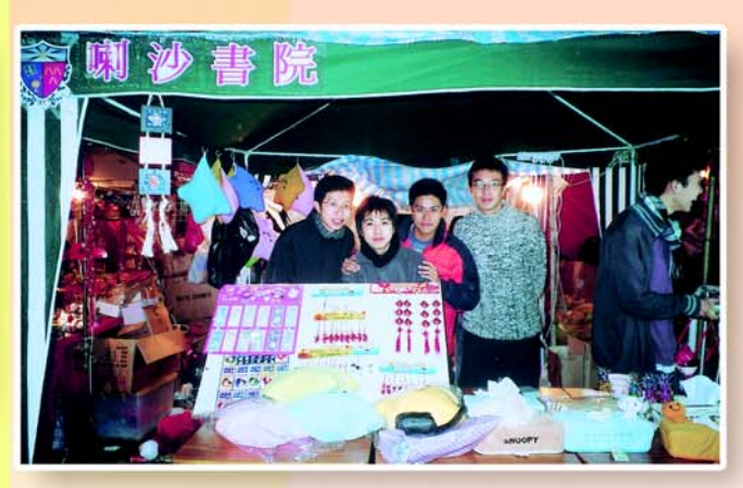
Our F.6 boys experiencing the business world by running a stall at the Lunar New Year Fair at Victoria Park.