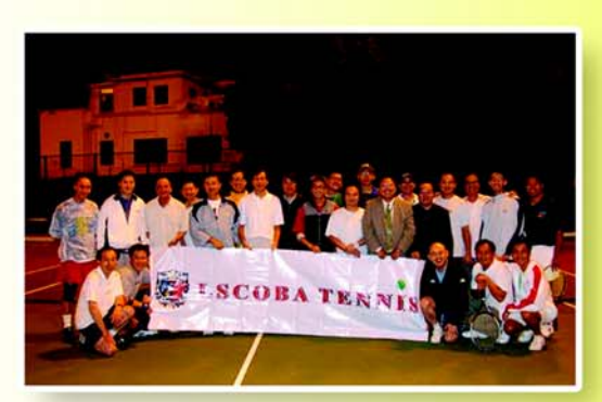
23 Old Boys enjoy the first ever LSCOBA Tennis Social Doubles in November 2003.