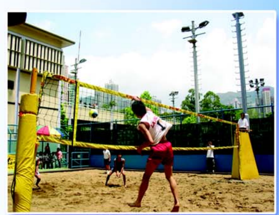
We win the Inter-school Beach Volleyball title outside Choi Hung Road Indoor Games Hall - 1st May, 2004