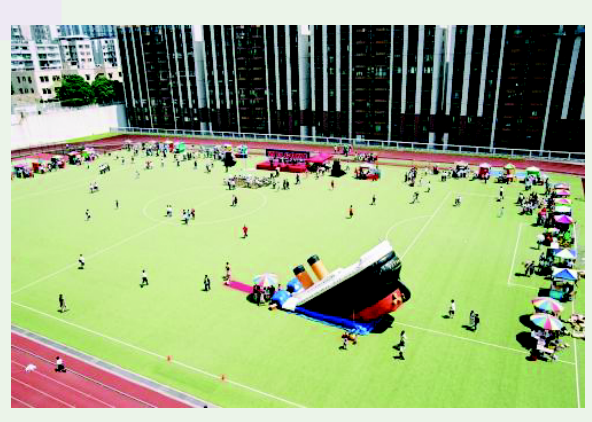
An aerial view of the Lasallian Family Fun Day