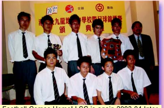
Football Comes Home! LSC is again 2003-04 Interschool Football Overall Champion (Division I).