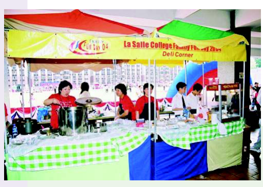
Deli Corner is run by supportive parents