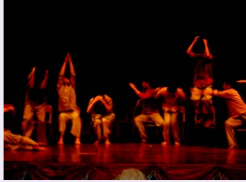
Award winning performance by LSC Dance Team at the School Hall