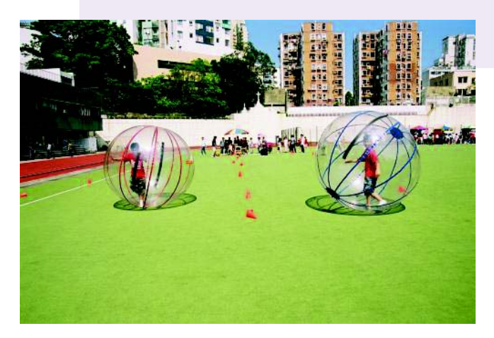
"Megaballs" are popular among the young participants.