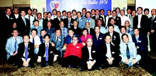
Class of 1974 enjoy their 30th Anniversary Dinner at Hong Kong Bankers' Club, Central - 2nd July, 2004