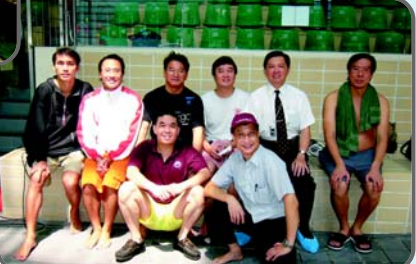
Seven Old Boys participate in the Annual Swimming Gala - 23rd September, 2004