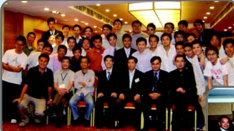
A Young Members Section Dinner is held on 5th June, 2004