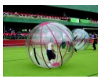
"Megaball" is once again a hit game of the Family Fun Day!

The day was ended with a Telematch, competed by four teams formed by the Parents, Teachers, Students and Old Boys. It was a keen competition and the Teachers and Old Boys teams were sharing the lead with a small margin right before the last game, the physically