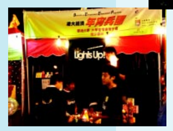
LSC students team up with HKU University Hall Students' Union to manage a Chinese New Year Stall at Fa Hui Playground .