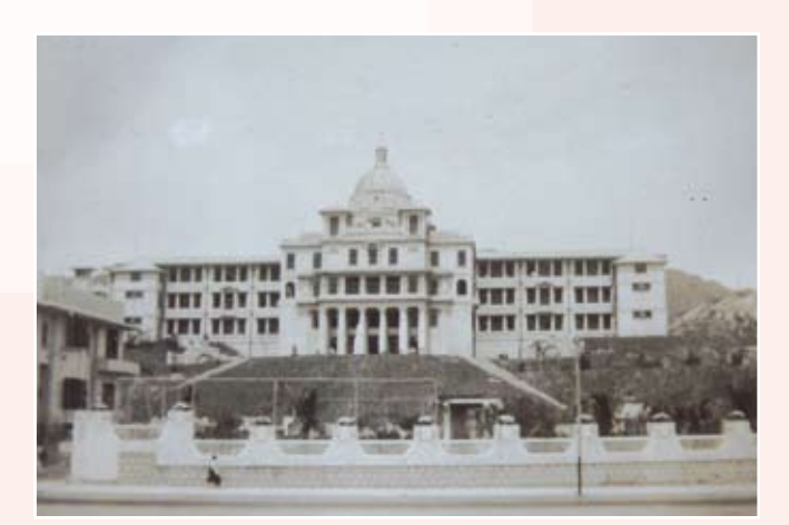
La Salle from Prince Edward Road 1937

I have the honour to inform you that I approve the proposals ... for increasing the area of land to be granted to the Christian Brothers as a new site for their present branch school in Chatham Road, Kowloon.