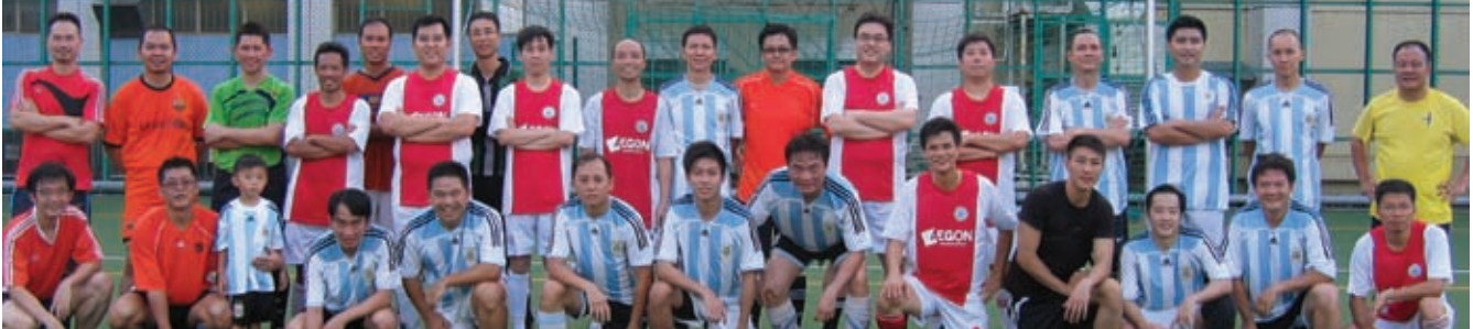
The rivals pose for a shot after the friendly match. LSC's Footballers in blue and white, and DBSers in red and orange.