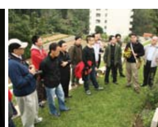
The stained glass The group listening to stories window in the Chapel of war dead Old Boys

Then at the school chapel, where among other sharings, Geoff pointed out the features contained in a beautiful stained