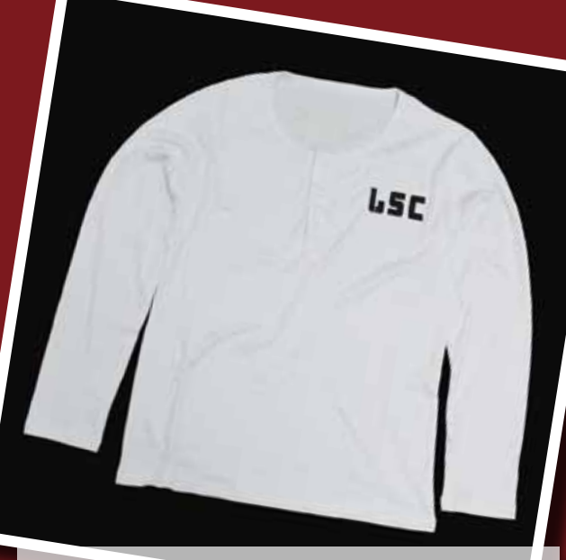
Long Sleeve Tee featuring LSC @$180 -Pure Cotton three-button henley neckline

Visit www.lscoba.com to order new souvenir items