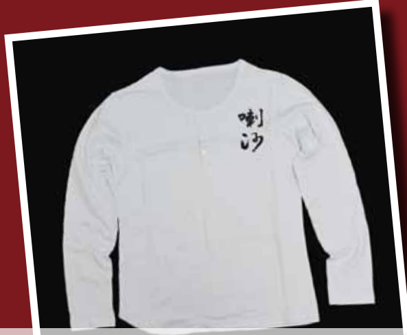
Long Sleeve Tee featuring 喇沙 @$180 - Pure Cotton three-button henley neckline