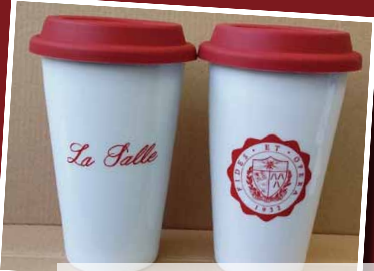
Tumbler @$120 - 10oz Porcelain La Salle crest printed mug, with silicone lid