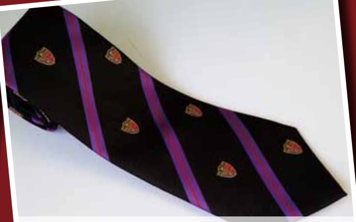
LSCOBA striped tie with crest embroidery @$180 (Remake of the 80th Anniversary tie)