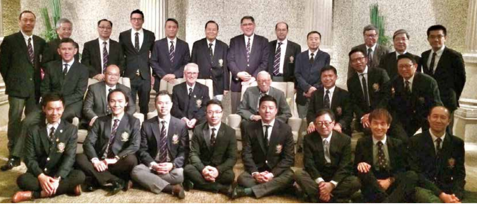
PAST PRESIDENTS' DINNER 2017