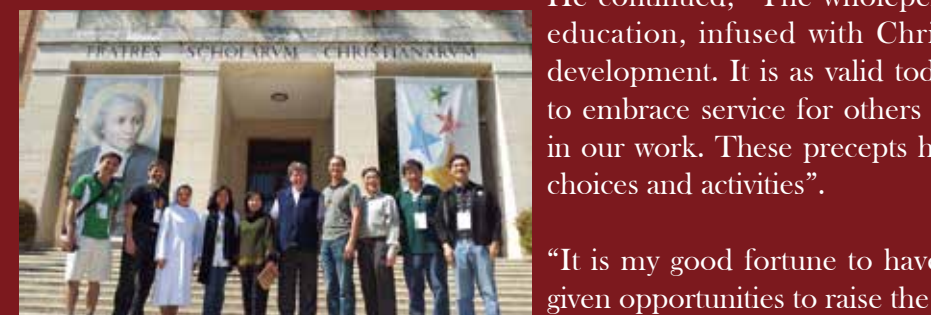
A LEAD Representative

and to be given opportunities to raise the Lasallian flag in various capacities". The affiliation is a singular honour and I can never repay the debt to the Brothers. I can only hope that I would be worthy of the Brothers' generosity and trust".