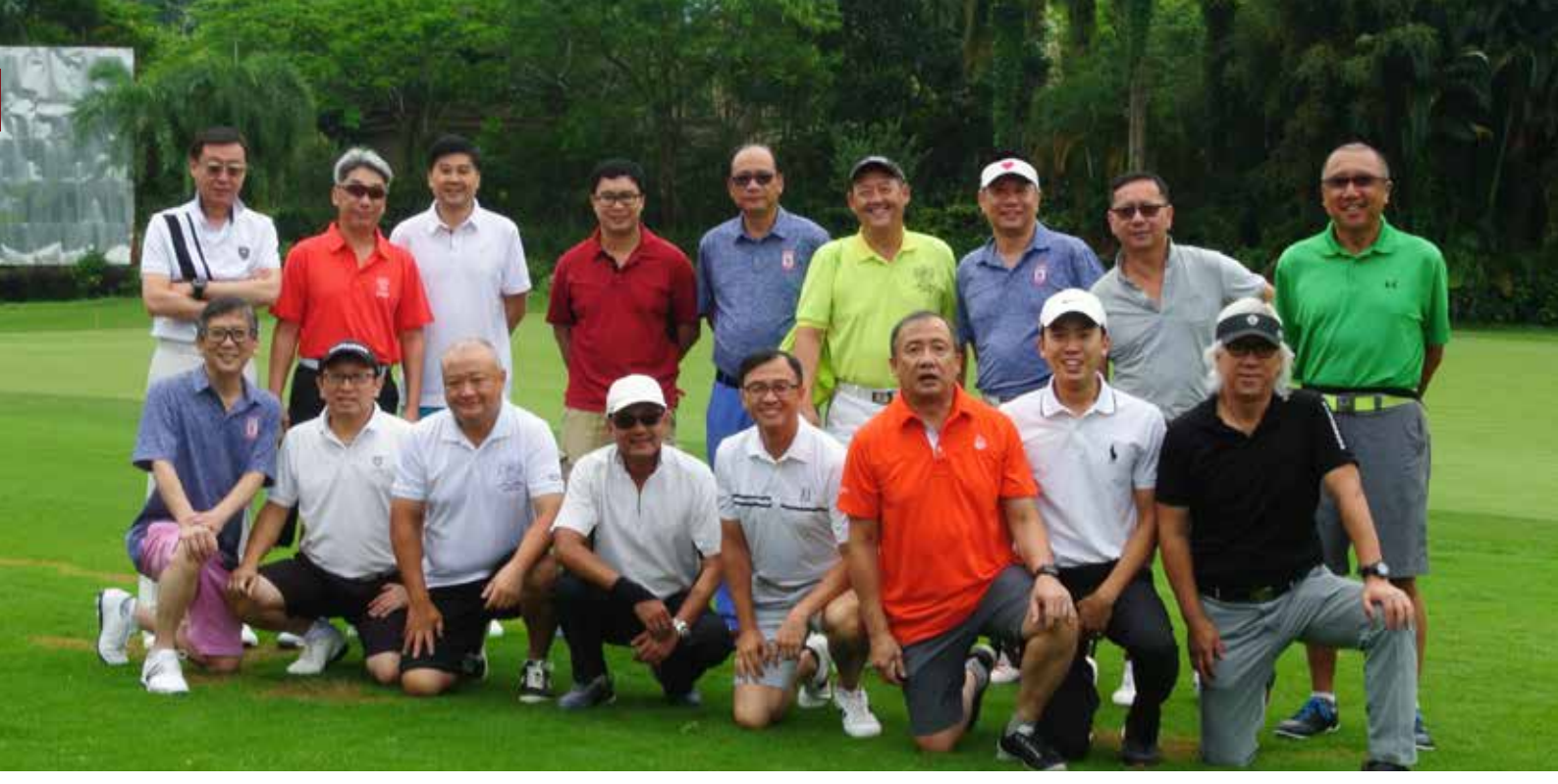
LSCOBA SUMMER GOLF TOURNAMENT 2017