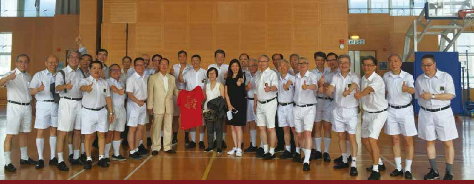
REUNION OF LA SALLE PRIMARY SCHOOL CLASS OF 1967