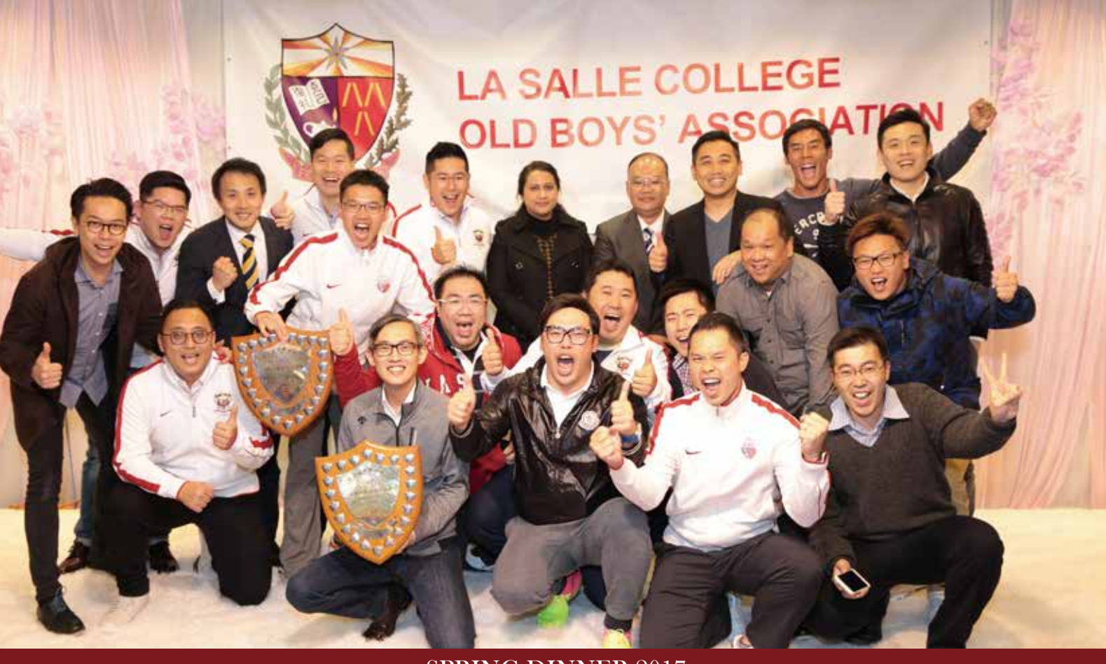
SPRING DINNER 2017