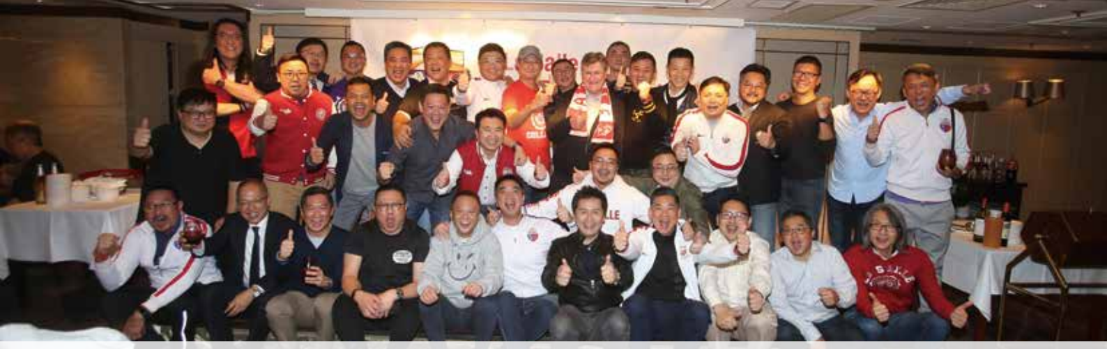
LSCOBA SPRING DINNER 2019 (AFTER ANNUAL INTERSCHOOL ATHLETICS FINALS IN WANCHAI)