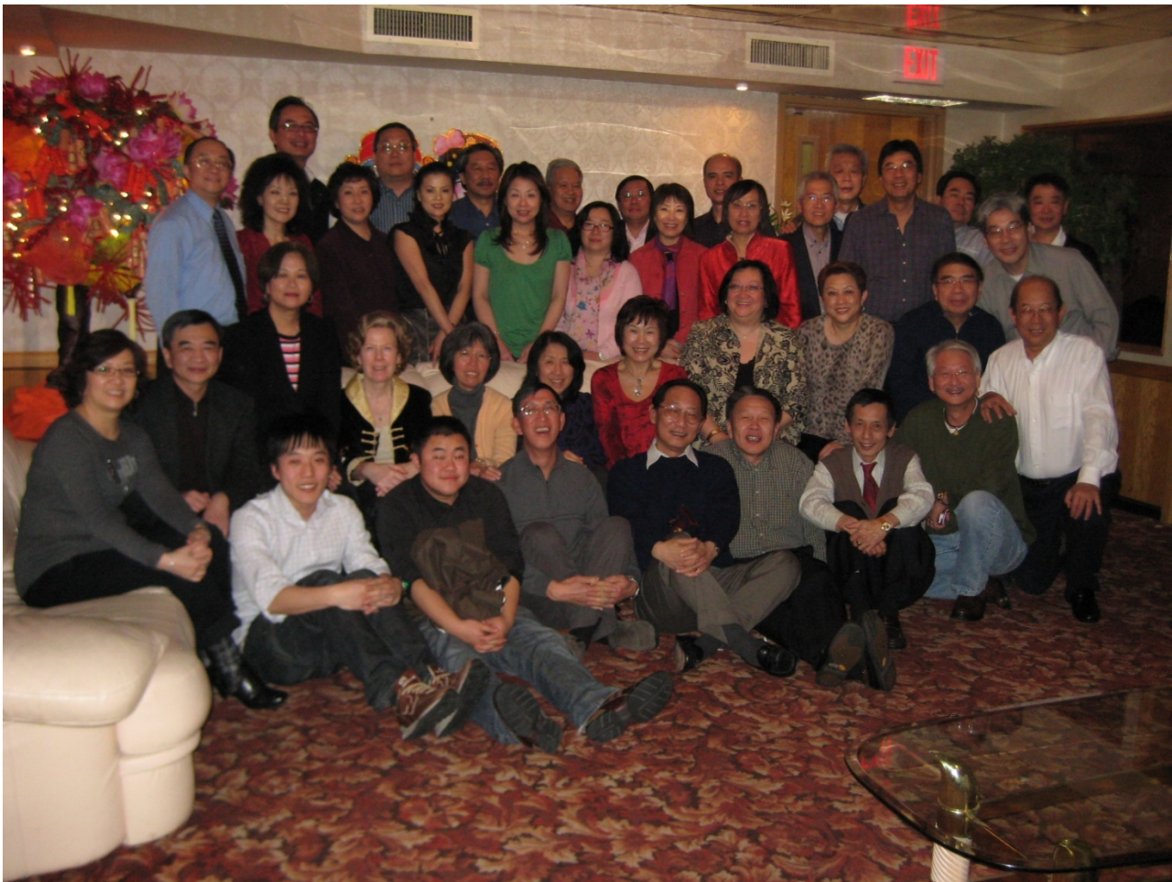
Group Picture of All Attendees

The board also approved the chapter to participate in the LSCOBA Global Alliance activities. The immediate task is to contribute to the monthly “The North American LaSallians” newsletter, currently hosted and produced by the Edmonton Chapter. The chapter will also participate in supporting the organization of LSC Global Reunion 2010 to be hosted by San Francisco chapter.