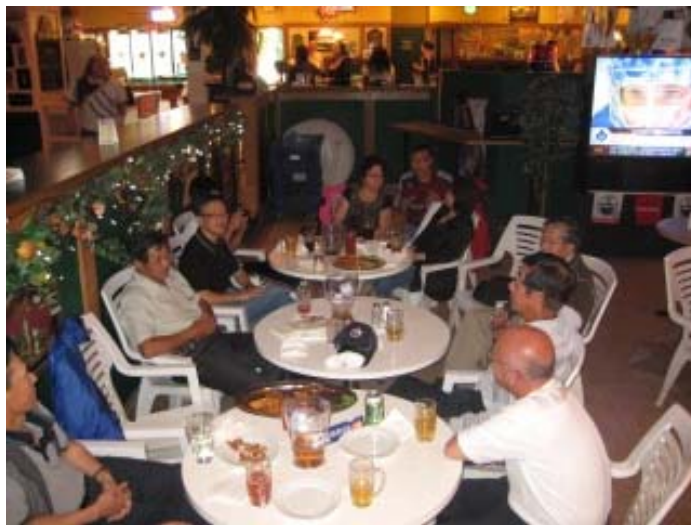
Good food, good beer, good spirit!