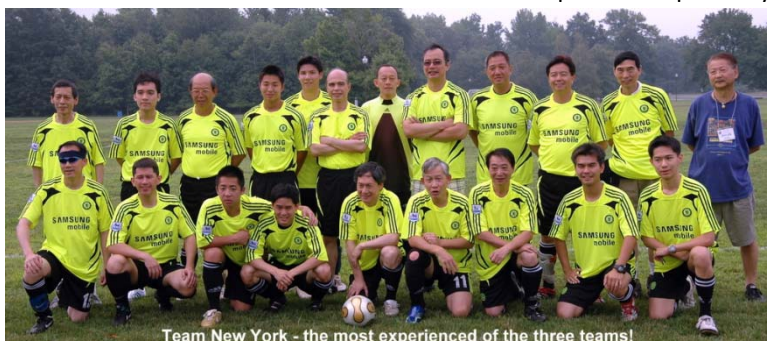
Team New York - the most experienced of the three teams!

As always, the football tournament is one of the key ingredients for a successful reunion and 2008 was no exception. Despite only three participating teams from California, Toronto and Edmonton/New York, the entire tournament was very sportsmanlike and fun-filled. Of course, the Edmonton/NY Team continues to be the most “experienced” team with an average age of over 40 (thanks to the leadership provided by half-a-dozen 花甲 players). Despite the many notches on their belts, these old warriors were butchered without mercy on the field but once again they earned the utmost respect from the young ones for their tireless effort and never give-up attitude.