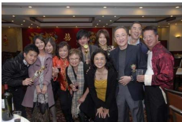
Winners of video game and Mahjong