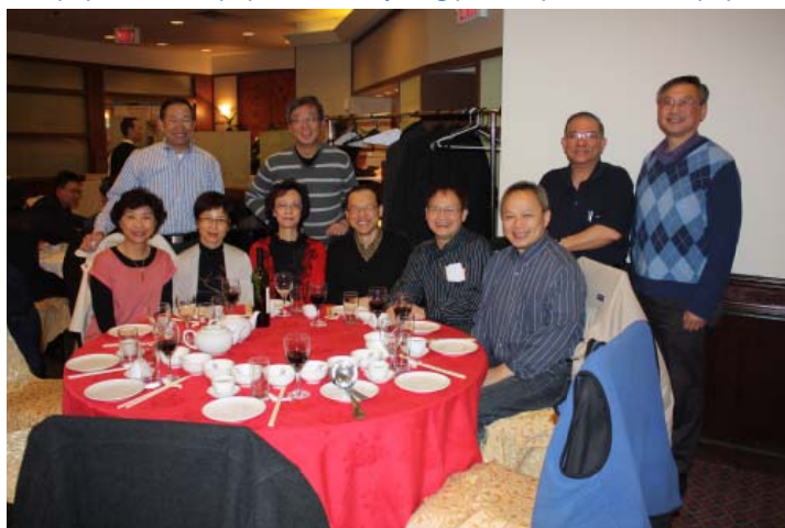
Class of 1967 and 1969 Table