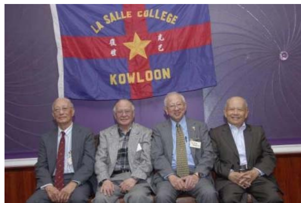
Class of 40's and 50's