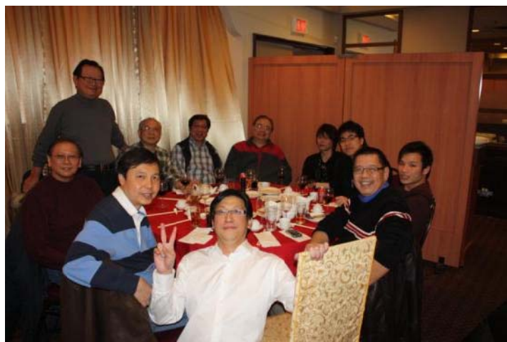
Class of 1961 and event assistants Table