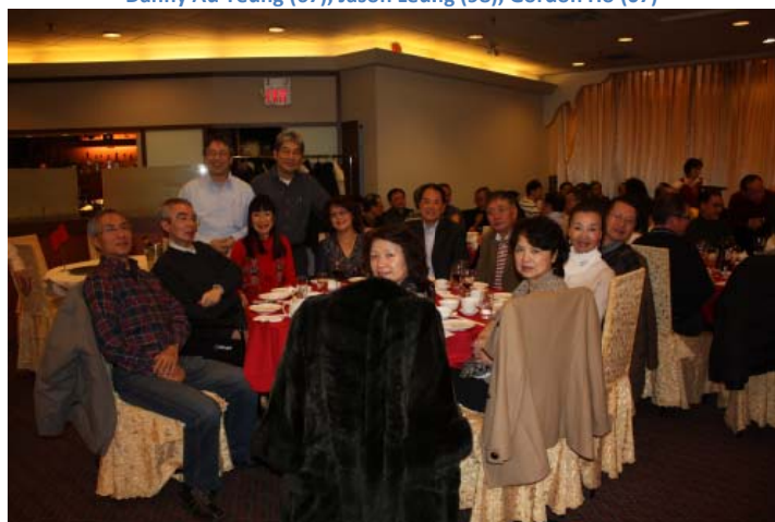
Class of 1966 Table