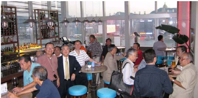
Happy Hour on November 4 kicked-off the Golden Reunion