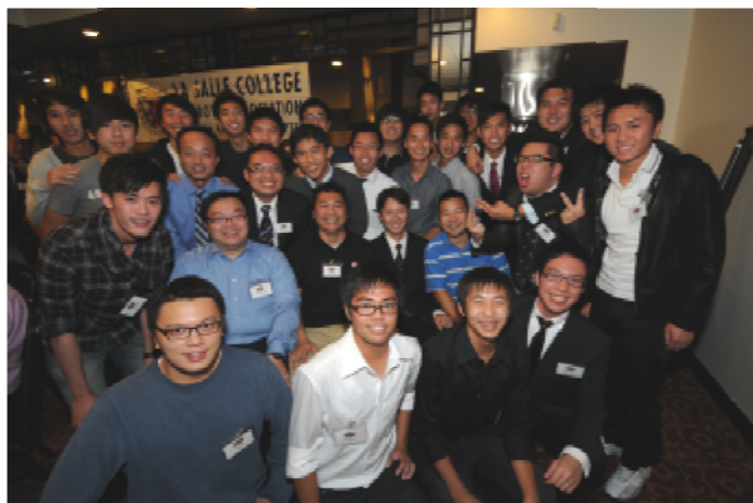
Young "old" boys from the 1990s and 2000s