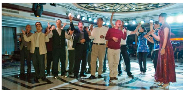
During the cruise the 61ers charmed the audience with an outstanding performance.