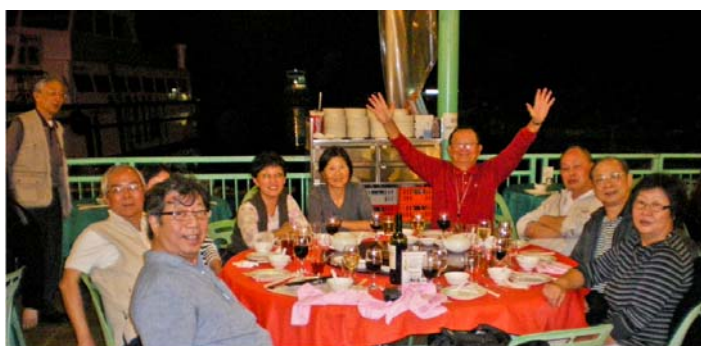
Seafood dinner in Lamma Island