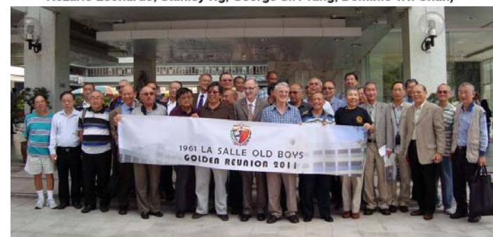
61ers touring the school