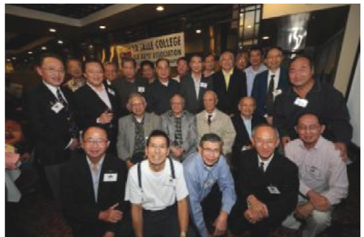
Old boys from the 1960s