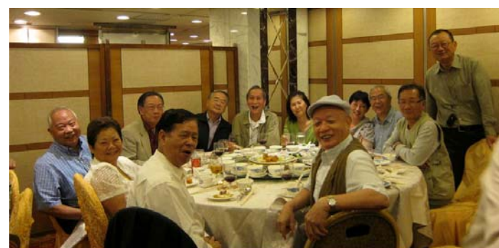
Farewell dinner Nov. 13, 2011