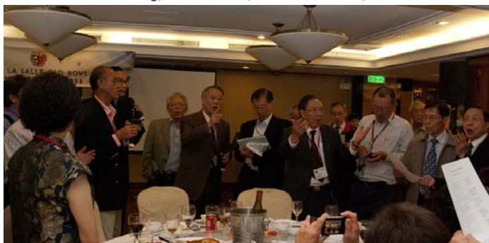
Concluded the evening with singing the school song