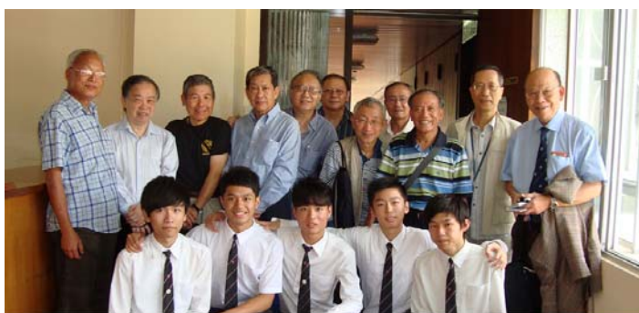
The young/future and the "matured"