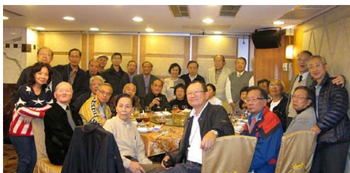
Dec. 5, 2011 last event of the reunion