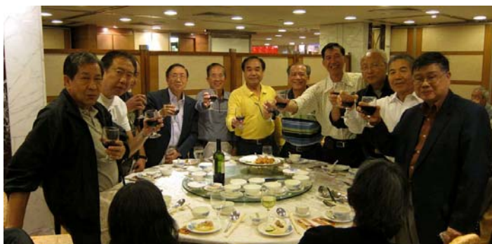
Farewell dinner Nov. 13, 2011