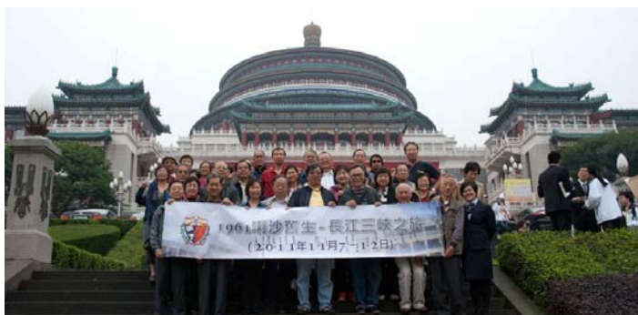
Group picture at the end of the cruise tour in Chongqing