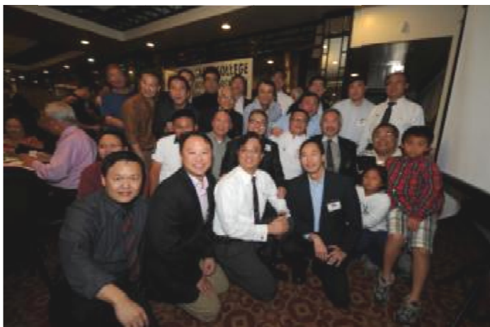
Old boys from the 1970s and 1980s