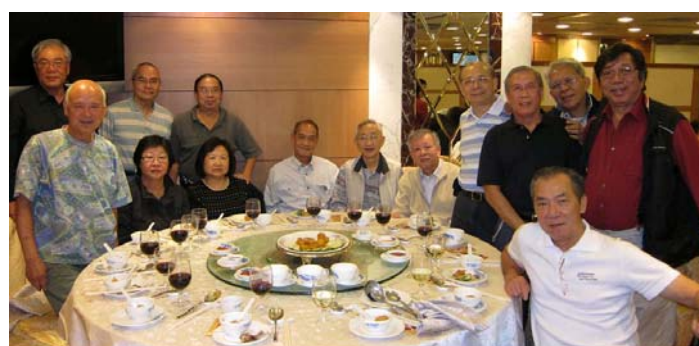
Farewell dinner Nov. 13, 2011