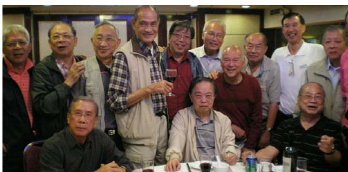
Nov. 21, 2011 more wine, more smiling faces