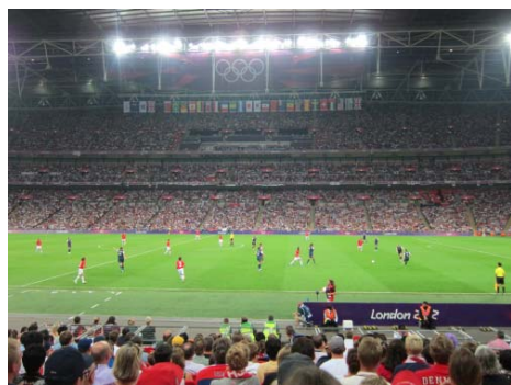
Women's Gold Medal game - US vs Japan