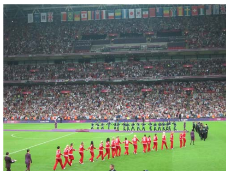
Canadian Women's Soccer Team entering stadium