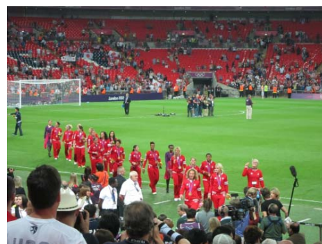
Canadian Women's Team doing lap thanking fans