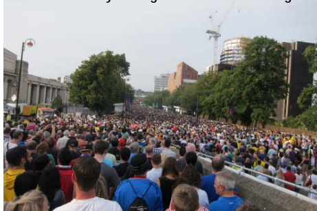
Massive humanity leaving for the Tube after the game

One of the concerns we had before going to the games was that fans might become rowdy erupting into chaotic disorder which seemed to be common with important soccer games in Europe. As it turned out, fans at the Olympic soccer games were very well-behaved. Of course, there was much loud cheering and chanting for the respective teams, but there was no improper conduct in the stands or outside the stadium, which was a relief.