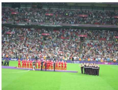
Canadian Team receiving Bronze Medal