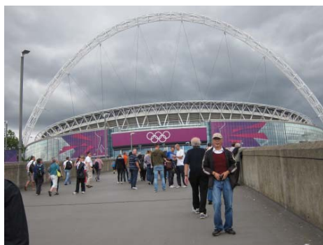
Front of Wembley Stadium