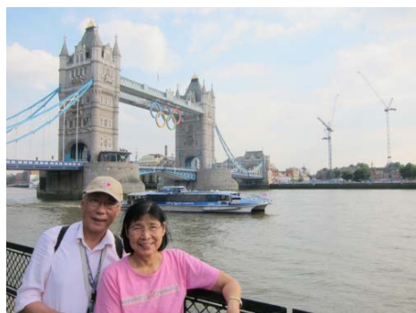
By the Olympic-ringed Tower Bridge

A gawky kid at La Salle, I always admired classmates and friends who were on school soccer teams and those who excelled in sports, spreading the reputation of LSC being "something more" than an extraordinary academic institution. I think one classmate actually made it to the Hong Kong Olympics team. Here we were, in the same class and just about the same age, and he was an Olympian and I was an athletically challenged teenager. I dreamt of attending an Olympic games somehow someday. But that thought was more like extreme wishful-thinking.