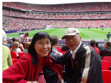
Inside Wembley Stadium