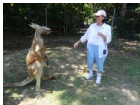
Back on land with new Aussie friend