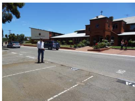
LSC Perth Administration Building

I struck up a conversation with some of these students and found out that the school was co-ed, which was kind of neat and convenient. Their La Salle boys do not have to go standing on the street corner to watch girls go by like what we used to do. They could do it right on campus. I didn’t see anything resembling a Maryknoll school in the neighbourhood. There’s no need - those lucky and enviable La Salle “Tsais”.