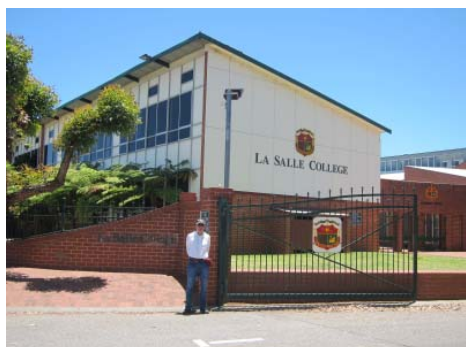
La Salle College, Perth

Perth is not very well known as a tourist destination, though some cruise ships do stop by at the nearby port of Fremantle. My main reason for going to Perth was to visit family and much time was spent with relatives whom I had not seen for years.