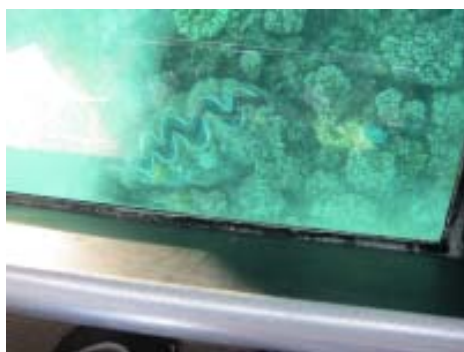
Giant clam seen from glass bottom boat