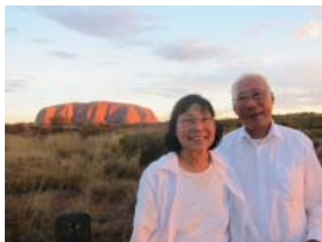
Yes we were there