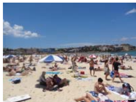
Vivien and sister under the umbrella on Bondi Beach