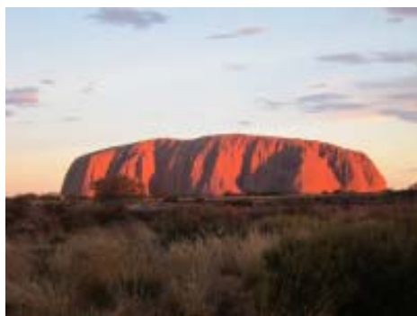
Rock's colour can change in minutes