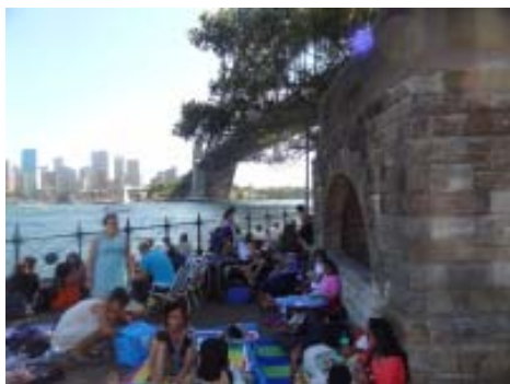
Camping out under the Harbour Bridge awaiting fireworks