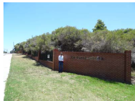
No Maryknoll outside perimeter of LSC Perth