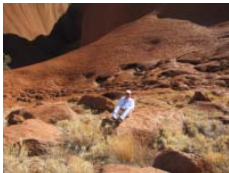
At the base of the Rock