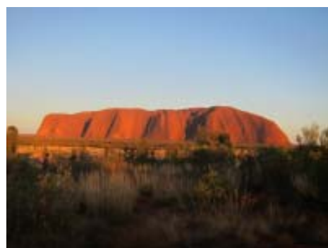
12 min after 6 a.m.