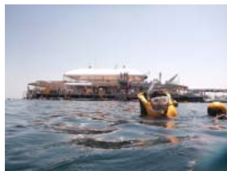
Snorkelling from a pontoon at the Outer Reef