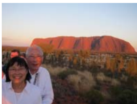
About 6 a.m.