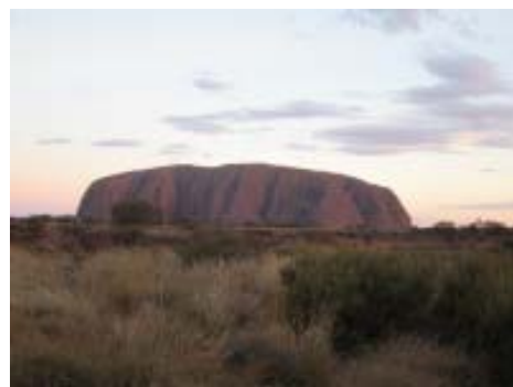
Rock darkens as sun disappears