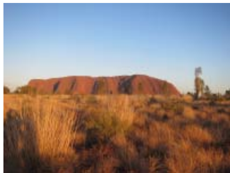
Quarter after 6 a.m.