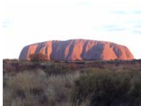
Beginning of sunset about half past 7 p.m.