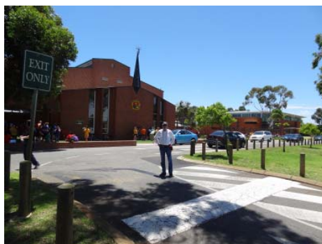
Main street on Perth LSC campus