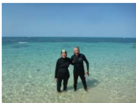
On Green Island