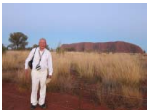
Sun about to rise

The recommended ways of appreciating the Rock was to see it at sunrise, at sunset and around its base (climbing was not allowed on the days of our visit). We did all three, in separate tours. It was a sight to behold with the changing colours on the rock face as the sunrises change angles hitting it. The morning colours are arguably different from the evening colours. The varying colour schemes of the same rock face were interesting and impressive in a way. At every stop on these tours, there were hordes and hordes of people jostling for positions in order to secure the most desirable viewpoints. Stepping back from these front-row views, I kind of wondered why people, including us, mind you, would spend all this money coming here just to stare at a piece of rock in the middle of nowhere. The fact that the tour price included all-you-can-drink champagne might have helped to relieve some of this doubt.