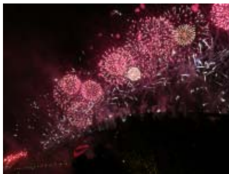
Fireworks shooting from the Bridge right above-head