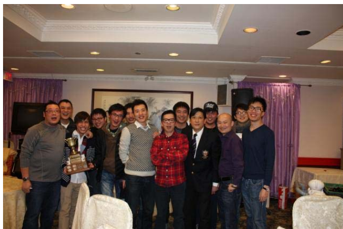
Youth members group photo!