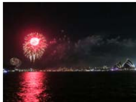
Vivien took this post-card-like photo of the Sydney NY fireworks