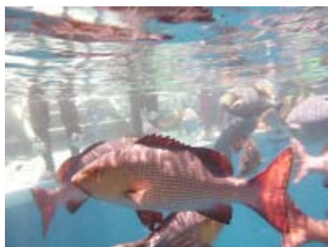
Swimming with colourful fish - underwater camera worked

We also took a couple of land tours to the rainforest and beach areas which were not that exciting, apart from some signs that warned hikers of biting crocodiles prowling in the neighbourhood.