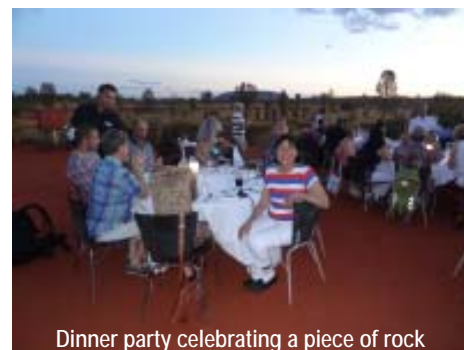
Dinner party celebrating a piece of rock

And, speaking of tourism dollars, the nearby Ayers Rock resort consists of a number of