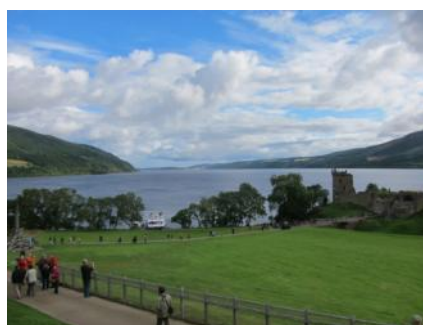
Loch Ness - no sign of monster from this direction