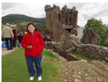
Close-up look at Urquhart Castle

Loch Ness is also one of the legendary places I had wanted to see. A stop-over at Invergordon allowed a day trip to the loch at the Urquhart Castle site. The castle, with a commanding view of the loch and hence of high strategic value, had witnessed many battles between the Scots and the English. Apparently, the MacDonald clan was a big player in these battles. But alas, no modern-day MacDonald's franchise was anywhere in sight when we visited. The cafeteria in the visitors' centre was not that good.