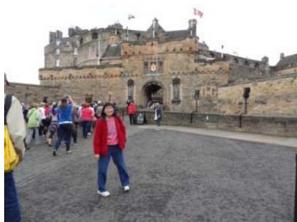
Entrance to Edinburgh Castle