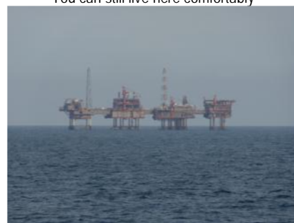
North Sea oil rig

Today, Scapa Flow is an important transfer point for North Sea Oil. We passed by quite a few of the humongous oil rigs en route. These mammoth structures were an amazing sight to behold, standing above the ocean on what looked like skinny legs with over-sized buildings on platforms that appeared to hold their weight only barely. We could easily imagine what it would be like if any of these things collapse, as reported from time to time.