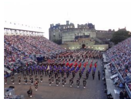
Royal Edinburgh Military Tattoo