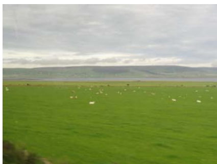
Sheep in bare landscape

Because of their commanding position over the North Sea, the Orkney Islands became a crucial strategic location for the Royal Navy during the two World Wars. The Royal Navy established a base in a harbour called Scapa Flow (meaning bay of the long isthmus). After Germany's defeat in WWI, many German war ships were interned here awaiting word on their disposal pending the signing of the Treaty of Versailles. Meanwhile, the German commander grew restless and ordered many of the captured ships to be scuttled in the harbour. Though the skeletal remains of the ships had largely been removed, one can still see some left-over structures of these vessels protruding through the waters.