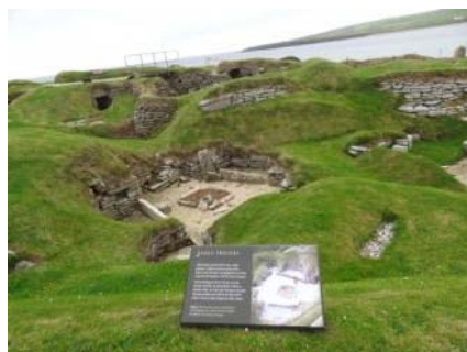
To this old house