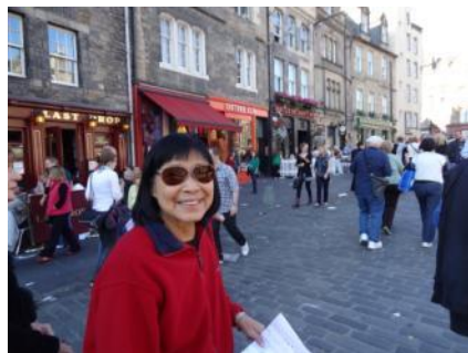
Drinking establishments on the Royal Mile