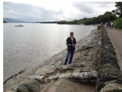
On the bonnie, bonnie banks of Loch Lomond