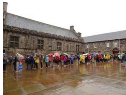
Queuing to see royal birthing room