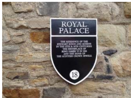
Plaque marking birthplace of King James IV