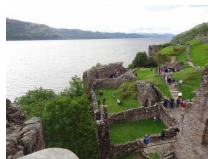
No monster viewed from the other direction either

There were tons of people at the site hoping for a glimpse of Nessie. But Nessie did not show. It must be an agoraphobic or enochlophobic creature.