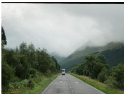
On the high road to Loch Lomond

There are several legends behind the song, The Bonnie Banks o’ Loch Lomond , though they are really variations of the same theme. The basic idea is that the song was a message from a Scottish soldier awaiting execution in a foreign land to family back home expressing his yearning for returning home and his grief for being unable to do so. He sang: “ Oh, ye’ll tak’ the high road, and I’ll tak’ the low road, and I’ll be in Scotland afore ye; But me and my true love will never meet again on the bonnie, bonnie banks o’ Loch Lomond ”. The “low road” is supposed to be the underworld passage back to Scotland when a Scot dies abroad. The “high road” is the motorway that our tour bus rode on the way to Loch Lomond, at least according to our tour guide.