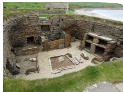
You can still live here comfortably