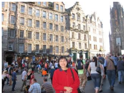
Royal Mile leading up to Edinburgh Castle

The most remarkable event in the castle, for me anyways, was the world-famous and one of the largest military shows in the world, the Royal Edinburgh Military Tattoo. It showcases a whole range of music, dances and drills against the magnificent background of the castle entrance. Performances were conducted by military bands from various countries and continents. Conspicuous in its absence was a Canadian band, though we were told there were Canadians embedded in some of the performing units.