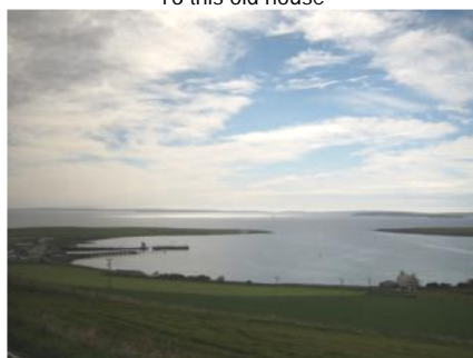
Part of former naval base - squint your eyes and you may see something portruding above water in the middle