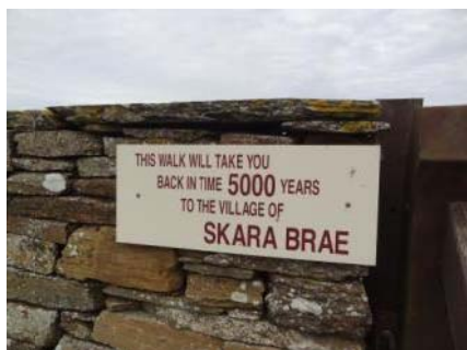
Go back 5000 years

The base was reactivated in the Second World War and it was here that the Royal Navy suffered a most tragic and embarrassing loss. A German U-boat penetrated the harbour, torpedoed and sank HMS Royal Oak, with 833 out of the 1400 crew perishing in the attack. The Royal Oak wreck has remained as an underwater war grave.