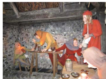
A scene from the Canterbury Tales exhibits