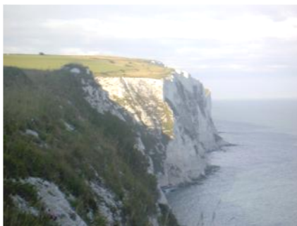
Close-up view of the Cliffs