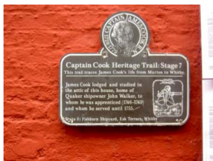
Plaque marking Cook's residence