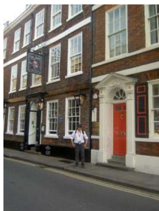
Guy Fawkes birthplace, now Inn and Pub

Inexplicably, November 5 Guy Fawkes Day has stuck in my mind ever since I came across it in one of our history classes in La Salle. Guy Fawkes was, well, the guy who was to assassinate King James with a large load of gunpowder on November 5, 1605. But the plot was discovered in time and Fawkes and his co-conspirators were caught and executed. November 5 has since been celebrated in Britain to commemorate the failed attempt on the King's life. It's baffling that a day has been named after a terrorist for commemoration. Moreover, the building where Guy Fawkes was born in York is now marked as a tourist attraction and converted into a popular inn and pub frequented by many tourists, including us a few years ago.