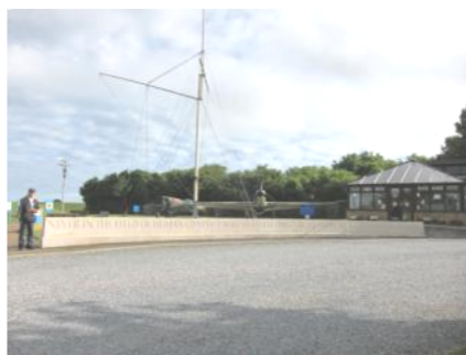
Churchill's words etched in stone