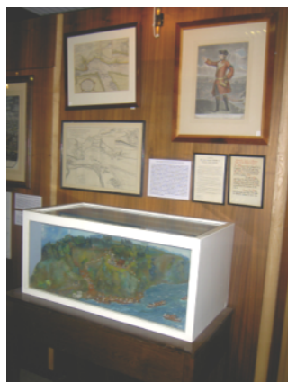
General Wolfe's exhibits, complete with the Plains of Abraham battle map