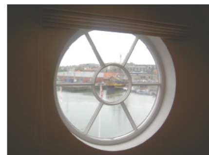
Looking out to the harbour from Cook's residence