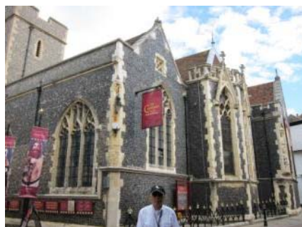
The Canterbury Tales are told in this refurbished church