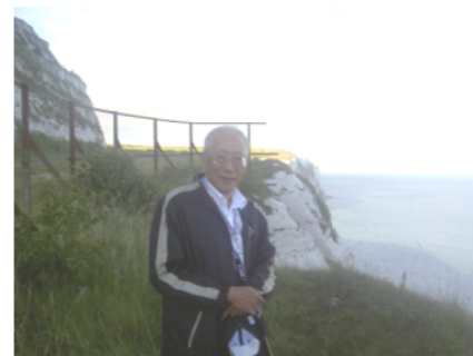
Me on the White Cliffs of Dover