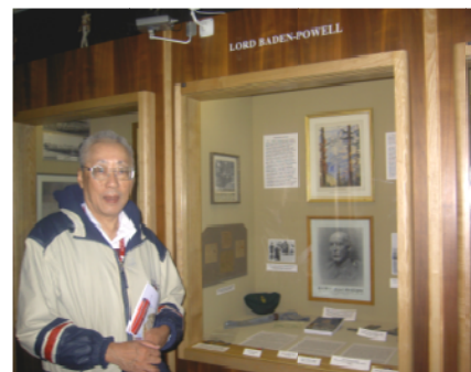
Baden-Powell and me

Wolfe's last order in that campaign and related written and graphic documents occupy a significant position in the museum. Wolfe was killed by a sniper in the battle. The General James Wolfe Monument in the Plains of Abraham Park marks the exact spot where Wolfe died. The famous painting, The Death of General James Wolfe , by Benjamin West hangs in the National Gallery of Canada in Ottawa.