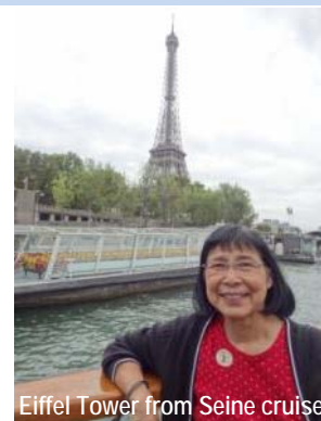
Eiffel Tower from Seine cruise

The last port of call before returning to Southampton was Le Havre, France. We took a day trip into Paris. We had been to this glamorous metropolis several times before but had never taken a boat ride on the Seine. We did a lunch cruise on the Seine this time, which provided a more relaxed appreciation of most of the well-known sites such as the Eiffel Tower without having to fight the crowds.