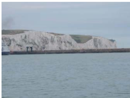
The iconic segment of the White Cliffs

Some of the WWII music remained quite popular in immediate post-war Hong Kong while I was growing up. The war had a profound effect on my mother who lost her father in a Japanese POW camp. She would often tune in to radio stations that played this music, the most prominent of which was Vera Lynn's The White Cliffs of Dover . I was practically imprinted with the song for the countless times I had heard it. I promised myself that I would be on the White Cliffs of Dover someday. That day was July 21, 2010.