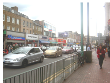
Edmonton England main drag