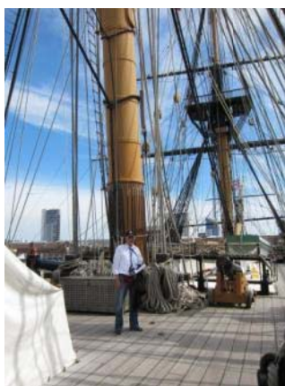
On board HMS Victory, Portsmouth