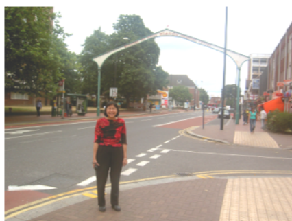
Edmonton, England claims to have good shopping, but no West Edmonton Mall