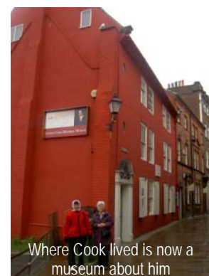
Where Cook lived is now a museum about him

Captain Cook had humble beginnings. He was born in Yorkshire. At age 16, he tried his hands at being a grocer's helper but did not do well. He then moved to Whitby where he apprenticed with a local ship-owner. There he caught the sea-faring bug and, as the saying goes, the rest is history. The house where he lived as an apprentice is now the Captain Cook Memorial Museum in Whitby where we visited on one of our trips to Yorkshire.