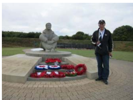
Battle of Britain Memorial

The Battle of Britain inspired the famous saying from Winston Churchill: "Never in the field of human conflict was so much owed by so many to so few". That saying was edged in concrete outside of the memorial to the Battle not far from the museum.