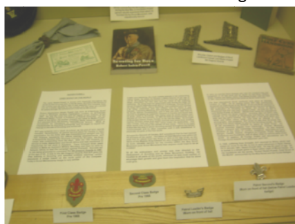
Closer look at Baden-Powell's scouting exhibit case