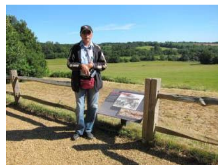
Site of the Battle of Hastings