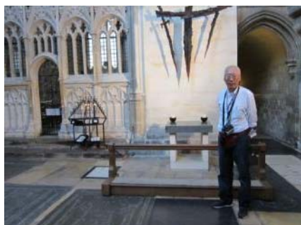
Exact spot where Thomas Becket was murdered

Chaucer, known as the Father of English Literature, is best known for The Canterbury Tales , a collection of stories about making a pilgrimage to Becket's shrine. The Tales has been considered as a major turning point in the English language as it popularized the use of English (albeit the "olde" style) as opposed to the then more common Latin or French. The Tales are told inside St Margaret' Church in the form of static models and sound effects.