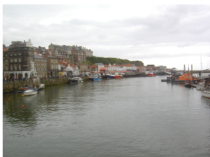
Whitby harbour, where Capt Cook learnt his craft