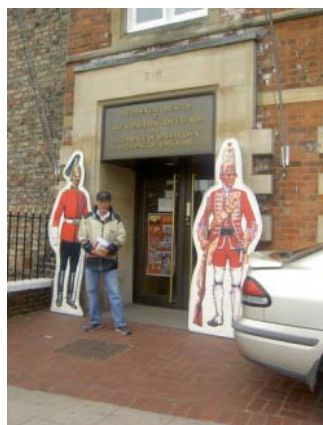
Regimental Museum in York housing artefacts from Baden-Powell and General Wolfe