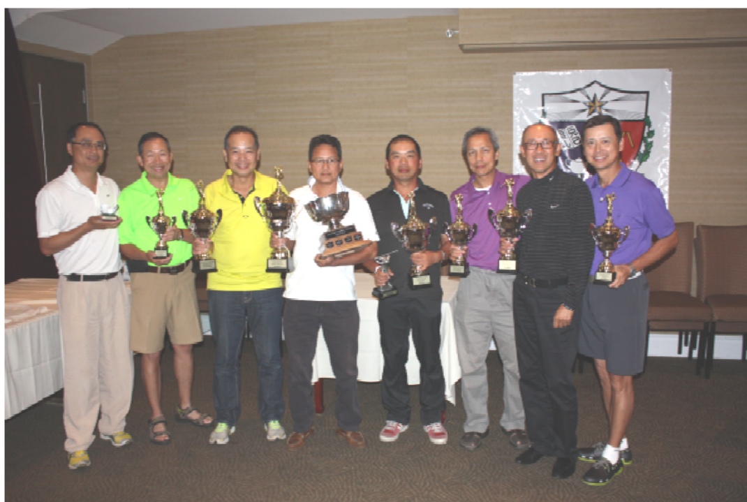
Title Winners Group Photo