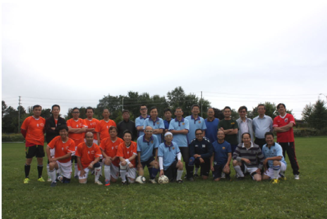
Group photo of Chinese University, HK alumni soccer teams vs Joint School Alumni soccer team