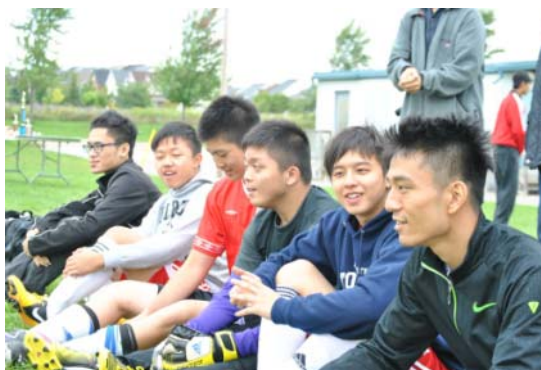
Our youngest players were waiting for the first debut of Toronto chapter soccer team!