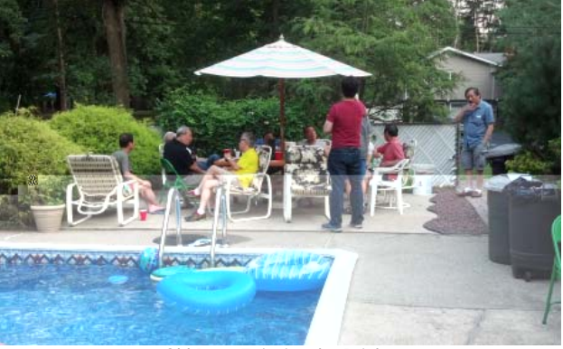
Old Boys Enjoying the Drinks