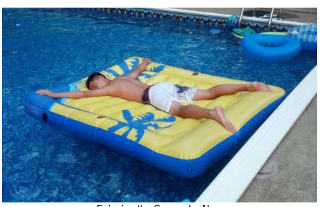
Enjoying the Sun and a Nap