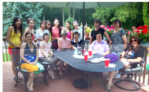
Lady Auxiliaries, Friends and Families