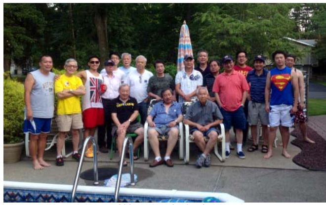
Old Boys and Friends

In addition to talking about the good old days, we talked about the walled city, and exchange information on good Hong Kong restaurants to visit. One interesting topic was how to avoid being caught when being late for school.