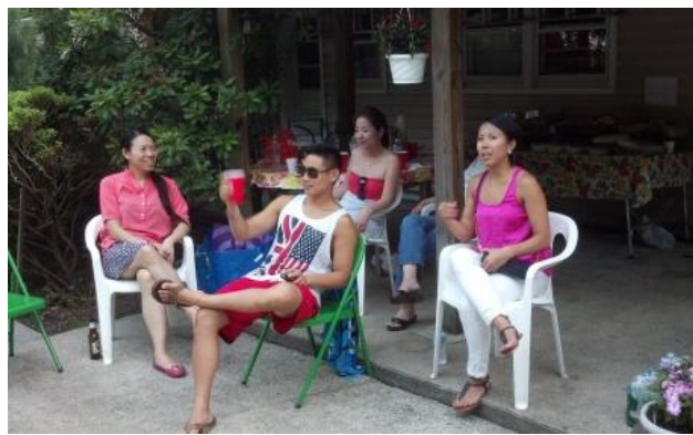
Pool Side Resters