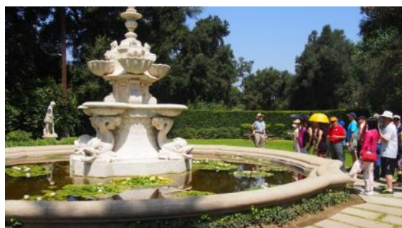
North Vista.