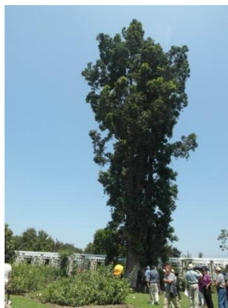
Queensland kauri.

After the guided tour, we visited the Chinese Garden, Liu Fang Yuan, the interior of the Huntington Art Gallery, and the Huntington Library. We marveled at the harmony of architecture and nature in Liu Fang Yuan, and spent a few moments appreciating the aesthetic qualities of Taihu rocks: slim, porous/dimpled, transparent, and wrinkled (瘦,漏,透,皺). At the Huntington Art Gallery, we were impressed by the portraits in the Thornton Gallery and the British landscapes upstairs. The special exhibition of Albrecht Dürer's engravings was a bonus treat, especially the ever-mystifying, symbols-laden Melencolia I . The new permanent installation titled " Remarkable Works, Remarkable Times ," in the Library's Main Exhibition Hall was an eye-opener. Around 150 rare objects were grouped thematically for display, including the First Folio edition of Shakespeare's collected plays, exhibited alongside the writings of the Bard's contemporary Galileo and other thematically-related objects of the Elizabethan era. Among the historic documents, a few of us were intrigued by the Chinese "coaching paper" displayed in another area of the cavernous hall. Written around 1930, it was purported to have been studied by an immigrant preparing for U.S. government interrogations upon arrival.