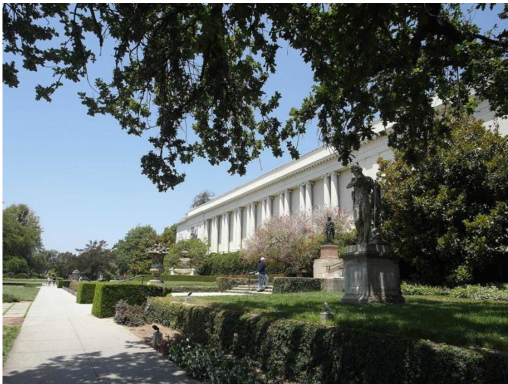
The Huntington Library

Founded in 1919 by Henry E. and Arabella Huntington, enthusiasts of books, art, and gardens, the Huntington comprises the Huntington Library, Art Collections, and Botanical Gardens. It is a world-class cultural, research, and educational center.