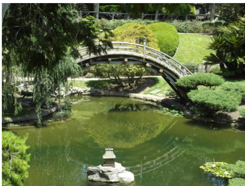
Half Moon Bridge, Japanese Garden.