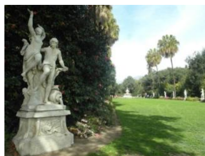
North Vista.