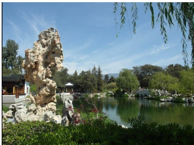
Liu Fang Yuan: Taihu rock and distant view of San Gabriel Mountains.

After the guided tour, we visited the Chinese Garden, Liu Fang Yuan, the interior of the Huntington Art Gallery, and the Huntington Library. We marveled at the harmony of architecture and nature in Liu Fang Yuan, and spent a few moments appreciating the aesthetic qualities of Taihu rocks: slim, porous/dimpled, transparent, and wrinkled (瘦,漏,透,皺). At the Huntington Art Gallery, we were impressed by the portraits in the Thornton Gallery and the British landscapes upstairs. The special exhibition of Albrecht Dürer's engravings was a bonus treat, especially the ever-mystifying, symbols-laden Melencolia I . The new permanent installation titled " Remarkable Works, Remarkable Times ," in the Library's Main Exhibition Hall was an eye-opener. Around 150 rare objects were grouped thematically for display, including the First Folio edition of Shakespeare's collected plays, exhibited alongside the writings of the Bard's contemporary Galileo and other thematically-related objects of the Elizabethan era. Among the historic documents, a few of us were intrigued by the Chinese "coaching paper" displayed in another area of the cavernous hall. Written around 1930, it was purported to have been studied by an immigrant preparing for U.S. government interrogations upon arrival.