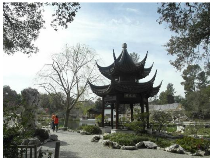
Pavilion of the Three Friends 三友閣

A high school student on a recent tour of Liu Fang Yuan composed the following couplet: