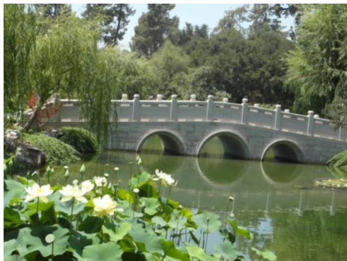
Jade Ribbon Bridge 玉帶橋 over Lake of Reflected Fragrance 映芳湖