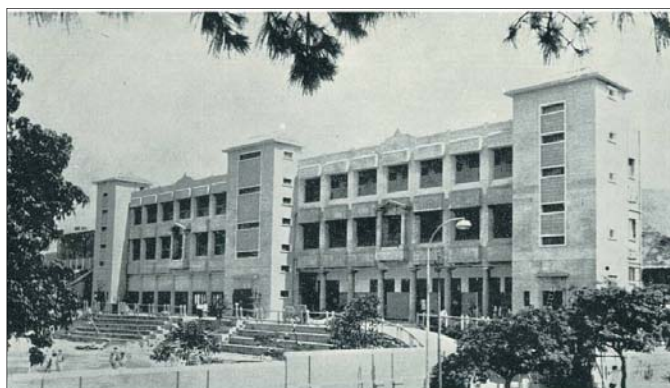
The newly extended school building of La Salle Primary School completed in 1960