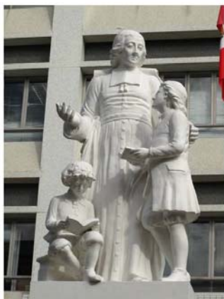
St. John Baptist de La Salle – Pray for us