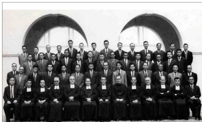
The finest educators in the La Salle College campus in 1963