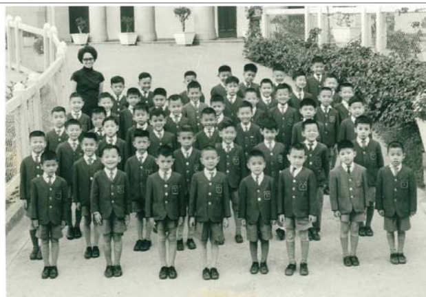
No matter which year, you can identify with the students of La Salle Primary School. They hold so much promise.