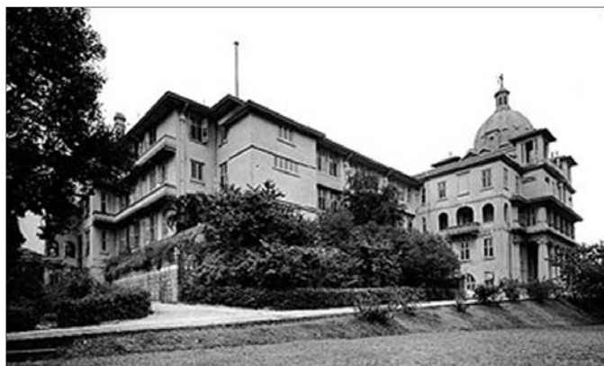
How we wish we could return to classes again under the tutelage of ...