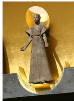
We are forever grateful. May God bless and keep them all.