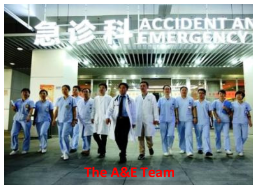
The A&E Team

confined to China alone, the problem has caused great concerns among the Chinese health workers nationwide. The top hierarchy in Beijing 3 already has put on the table specific laws to safeguard the safety of both health workers and patients, 4 yet violations remain unabated. As said in an adage: "Technologies and hardware are easy to have - pay the right money and delivery can be made; knowledge and software are relatively fairly easy if the environment is favorable." But cultures are intricate and even protean, as "provider-receiver" scenarios are the most difficult hurdles.