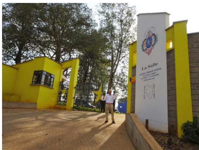
Front gate of LSPS Nairobi