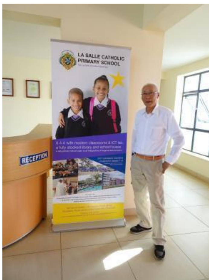
LSPS Nairobi poster at school administration reception

Note the colour scheme of the buildings – red and purple, the La Salle colours familiar to us.