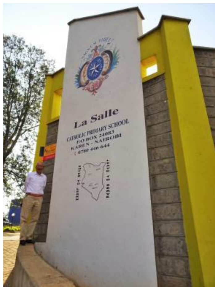
Front gate of LSPS Nairobi