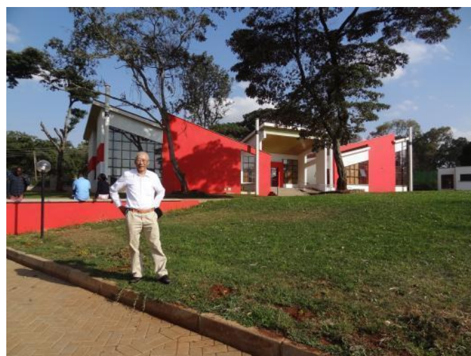
In front of the administration building