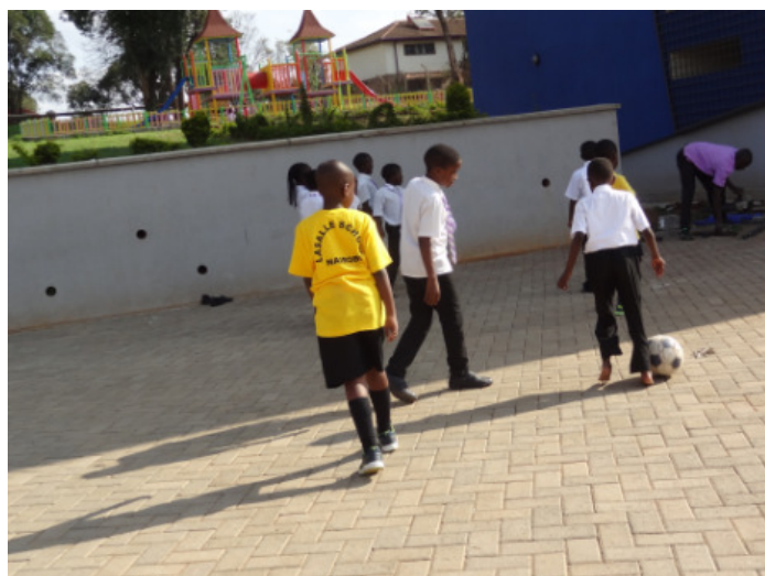
Our African fellow La Salle boys in playground

Note the colour scheme of the buildings – red and purple, the La Salle colours familiar to us.