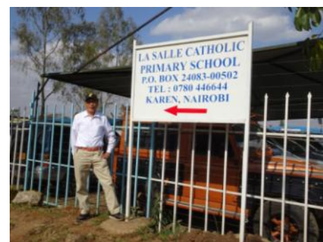
Roadside sign announcing the “La Salle Catholic Primary School”

The school grounds are actually situated some distance from the main road and the sign. It is a fenced campus with a measure of security at the gate. When I explained my purpose of visit to the security guards, they were more than accommodating and welcomed our visit.