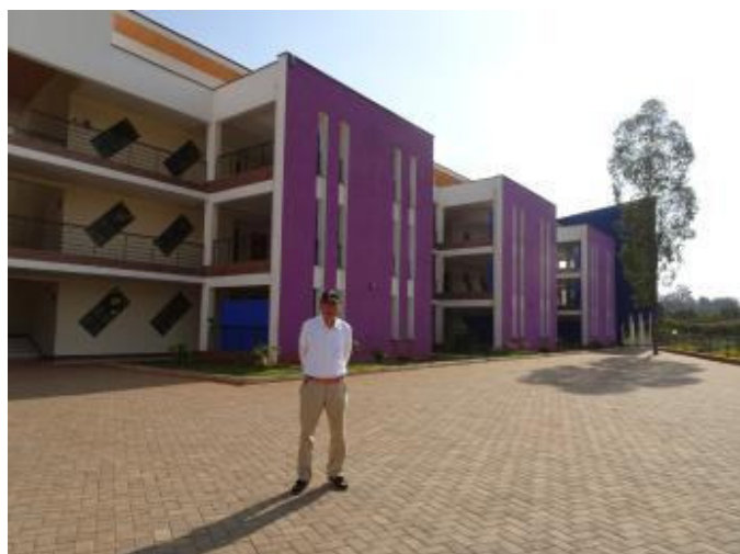
Classroom building and hallway