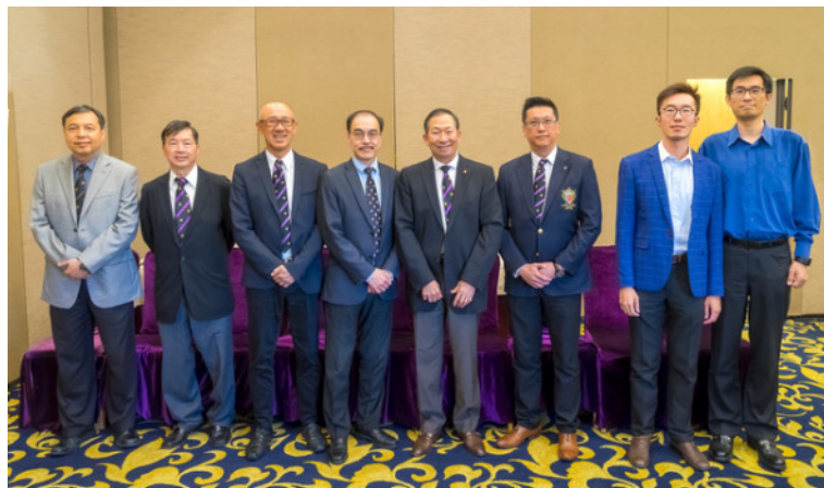
Photo of Officers (L to R)