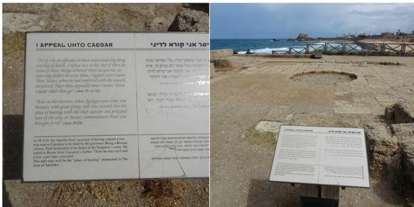
The very spot where Paul was incarcerated and interrogated before being shipped to Rome for trial