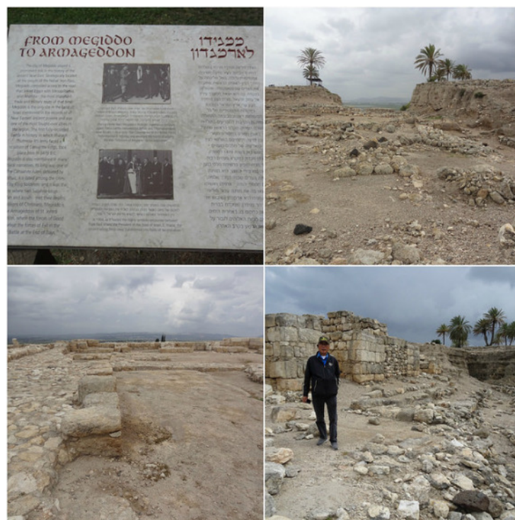
Standing on the doomsday grounds of Armageddon

This final world war is referenced in other books of the Bible, e.g. Daniel, Zechariah, Isaiah, Ezekiel. Three major armies are mentioned, one from the south, one from the north, and one from the east. There is speculation in the literature asserting that Russia (from the north) and China (from the east) will be involved in this apocalypse. Believe it or not.