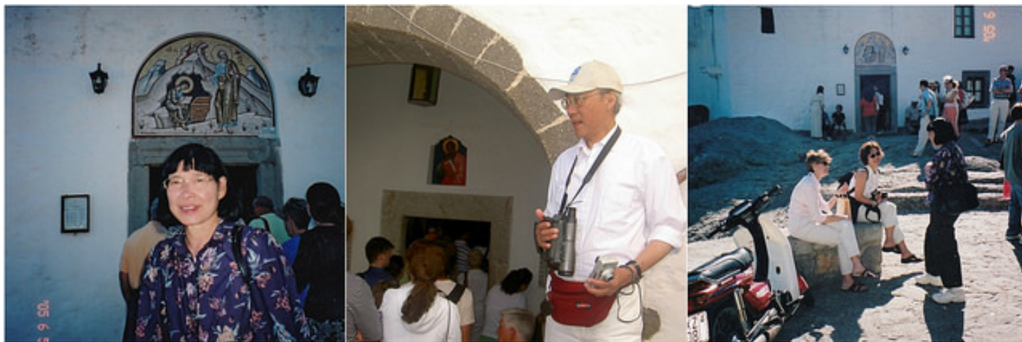
Cave of the Apocalypse in Patmos

John the Divine wrote the Book of Revelation after he was banished by the Romans and exiled to the island of Patmos in the Aegean Sea. He lived in a cave. The island was small and barren. He was basically in some form of solitary confinement. It was under these circumstances that he wrote the Book. I visited Patmos and his cave a few years back. I can see how, in these conditions of social deprivation and lack of meaningful external stimuli, one's imagination and fantasy can run wild, particularly if the person has certain predispositions.