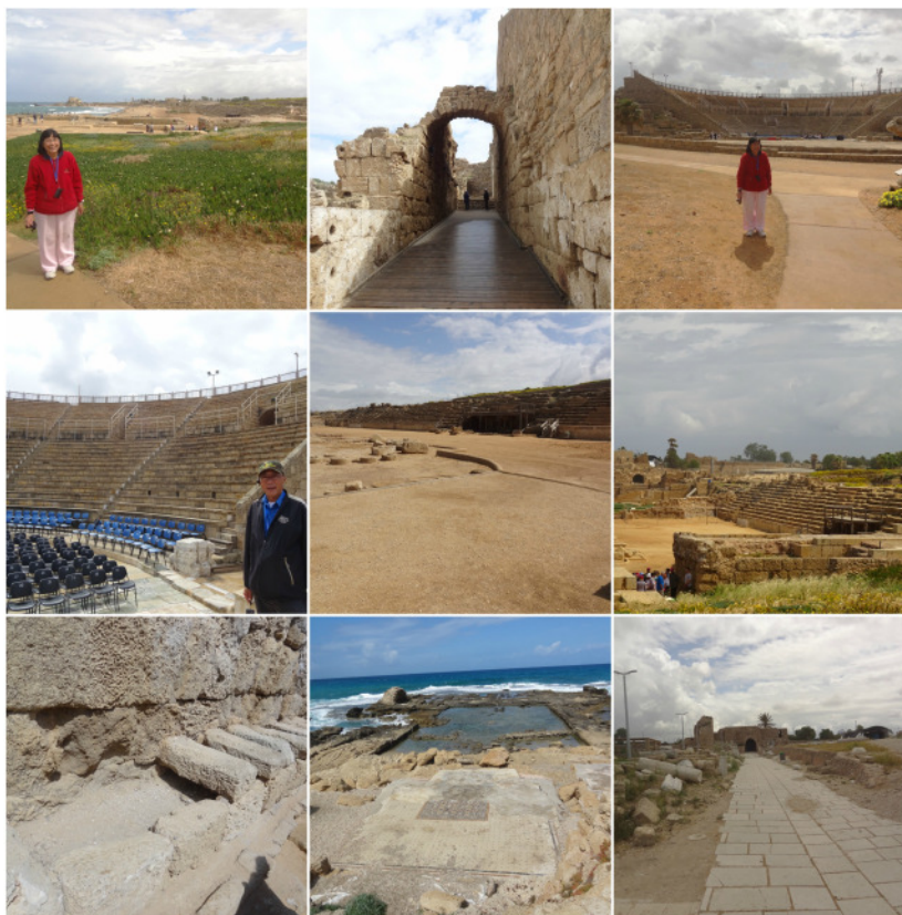
Caesarea - the New York of the ancient world, complete with sophisticated buildings and harbour facilities, statues, theatres, race courses, ball parks, immigrants, transients, and public loos. Pontius Pilate used to live here.