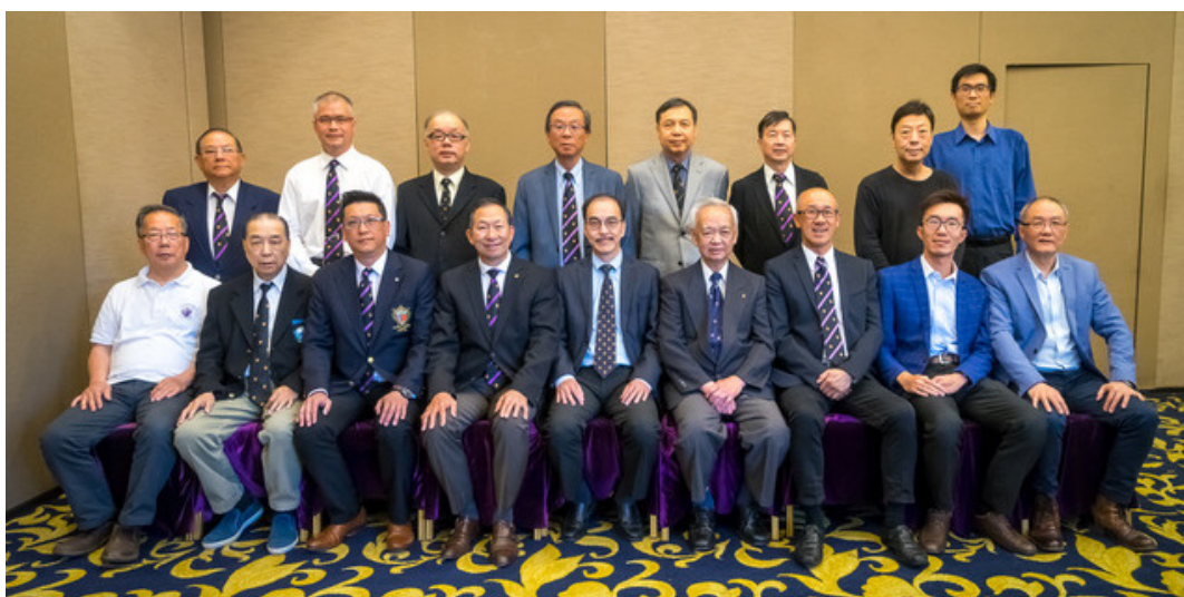
Photo of full Board