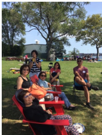
Some of Our Ladies Auxiliary

Another successful event organized and arranged by LSCOA/NY chapter on a beautiful Saturday afternoon on Governor's Island, with the Statue of Liberty as a backdrop. The event was enjoyed by close to 100 participants from Wah Yan, Maryknoll Convent School, Saint Paul Convent College, St. Joseph, St. Clare, St Stevens, HKU and Ying Wah Girls that we called the HK School Alumni Association.