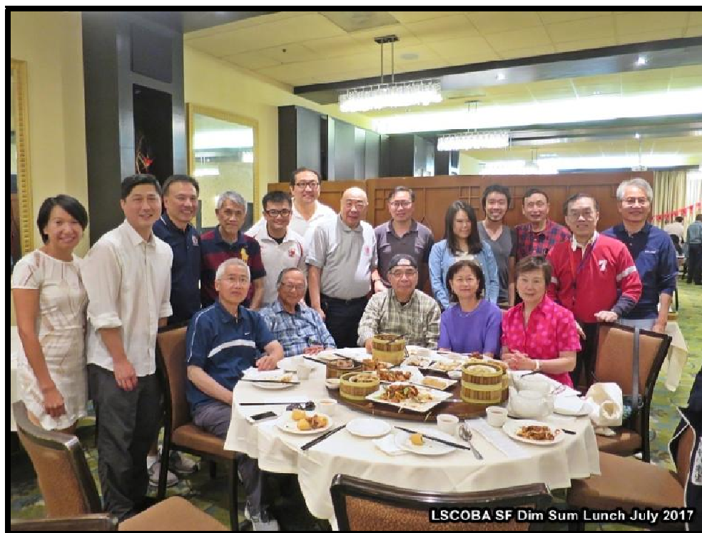
LSCOBA SF Dim Sum Lunch July 2017