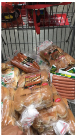
Food, Food, and More Food