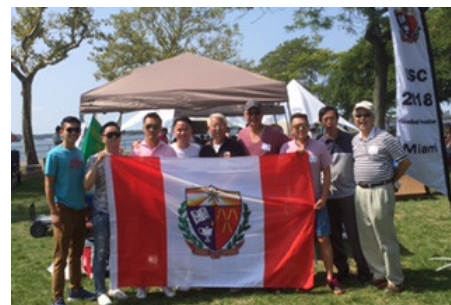
The La Salle Crew

The age group ranged from infant to 70s. People are finding new friends as well as long lost ones. For the next 3 days after the event, I still received praises, 'Thank-you's, and urges for the next event. LSCOA is always the leader of the pack. La Salle is always something more!