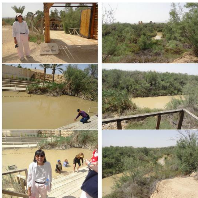
The River Jordan 2000 years after Jesus' baptism (people still doing it, in dirty water)

baptized of him" (Matthew 3:13). "And it came to pass in those days, that Jesus came from Nazareth of Galilee, and was baptized of John in Jordan" (Mark 1:9). Luke recounted that John was practicing his craft "in the wilderness" and "into all the country about Jordan" where "Jesus also being baptized" (Luke 3: 1-2, 21).