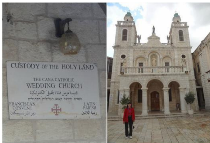
Cana Wedding Church – location of first miracle changing water into wine

We visited the site, but did not make any wedding bookings or try to change cash into wine. We did see the big jars that supposedly Jesus would have ordered to fill with his concoction.