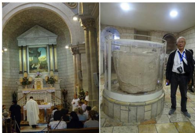
Inside the Wedding Church and a wine jar possibly used by Jesus – note the wedding scene above altar