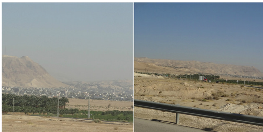
Jericho and surrounding desert from a distance – where Jesus was supposed to have been tempted by Satan