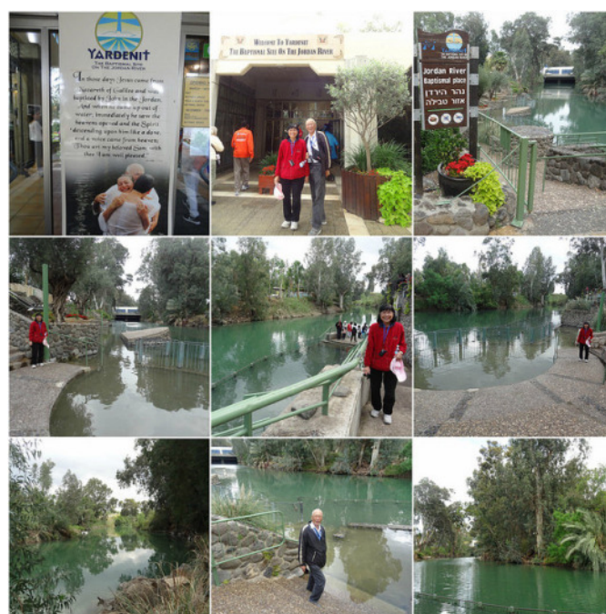
The competing Baptismal Site at Yardenit, with cleaner water

have travelled to for the ritual. We also visited this site which is more built up and pleasant. The river is wider and the water is cleaner. There is an amphitheatre and baptism pools that can be