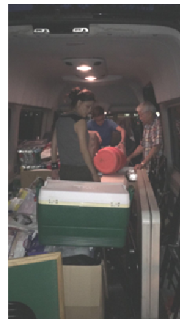
Our First Lady Loading the Truck