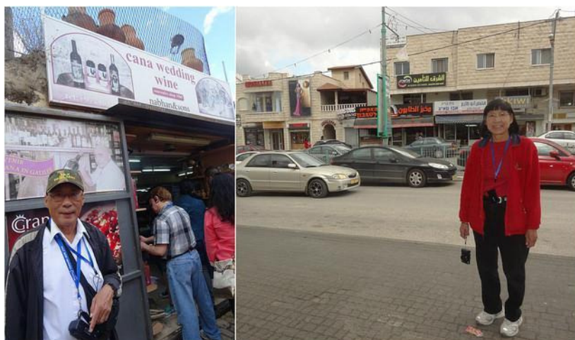
Modern-day Cana and store changing cash into wine