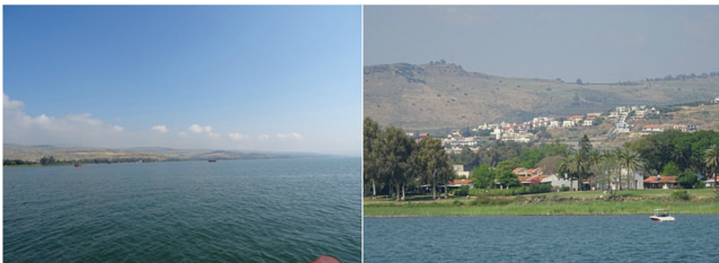
View from Sea of Galilee: left – Capernaum; right – Magdala, hometown of Mary Magdalene.

To gain a sense of the kind of ship that Jesus was walking on water toward and was trying to prevent it from capsizing from the storm, one can visit the "Jesus Boat" exhibit in the Yigal Allon Museum in Kibbutz Ginossar just a few kilometres south of Capernaum. The boat, found in 1986, is supposed to be dated to the first century and is believed to be the same type but not necessarily the same one that Jesus and his disciples used. You can also go on a boat ride in the Sea of Galilee in a replica boat, pretending you are Jesus or one of his disciples.