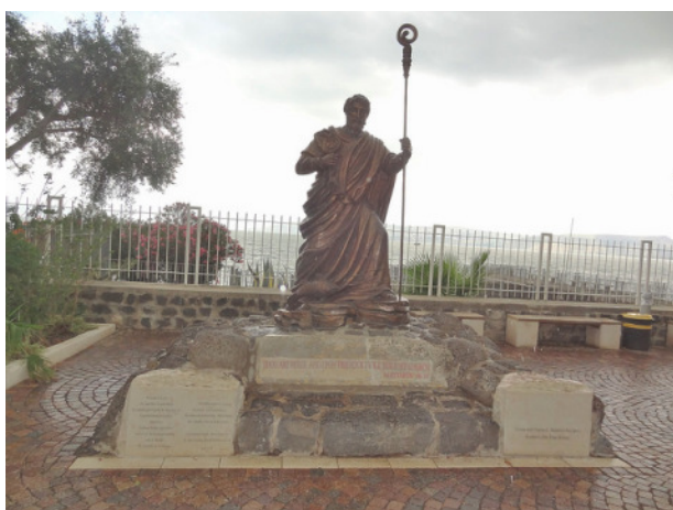
Peter's statue in Capernaum, commemorating Jesus saying to Peter “...thou art Peter, and upon this rock I shall build my church” (Matthew 16:18). Also note Sea of Galilee in background, near where Jesus allegedly walked on water.

Apparently, Peter was quite an affluent fisherman when Jesus recruited him. Peter had a big house in Capernaum which is still being excavated.