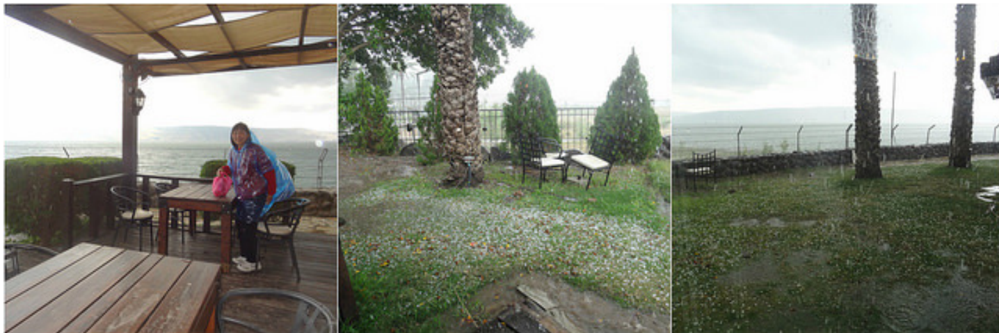
Hail storm at the Sea of Galilee – this tempest settled down without divine intervention

Jesus went on to do more healings in the course of his travels. Miracles aside, it has been suggested in some literature that Jesus was a very talented natural-born therapist, particularly in what we now know as hypnotherapy. He was apparently the Dr Phil of his day. Dr Phil has the benefit of electronic mass media exposure. Without that technology, Jesus took his therapy show on the road in person.