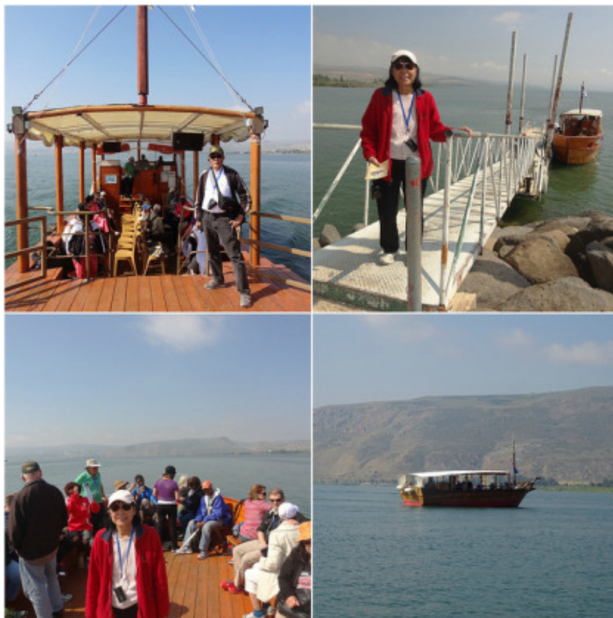
Sailing the Sea of Galilee

The weather was so volatile that if you wait for a while the "great calm" will return without further