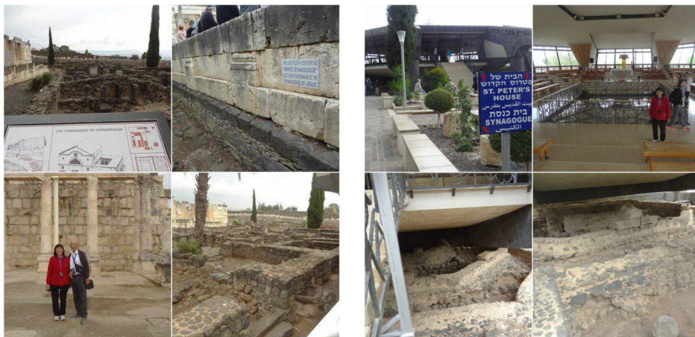
Synagogue of Capernaum where Jesus used to preach

Then the news spread and soon Jesus was inundated with requests for treatment. “When the even was come, they brought unto him many that were possessed with devils: and he cast out the spirits with his word, and healed all that were sick” (Matthew 8:16).