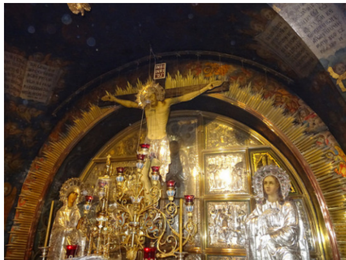
Station 12, Jesus died on the cross