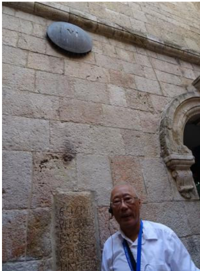
Station 6, Veronica wiped Jesus' face