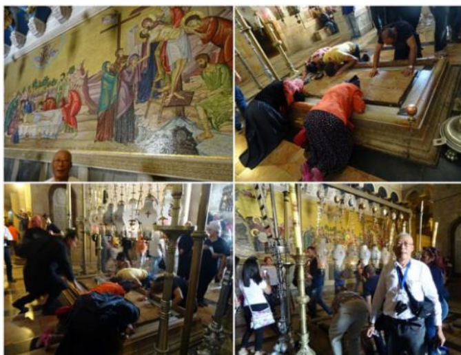
Station 13, Jesus taken down from cross and laid on this piece of rock