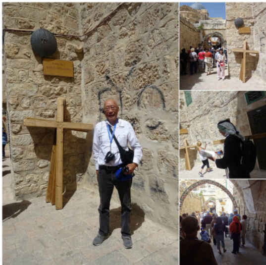
Station 9, Jesus fell for the third time