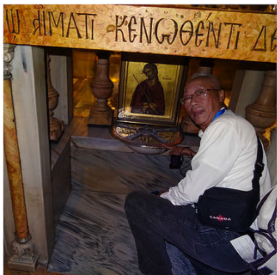
Exact spot where Jesus' cross stood