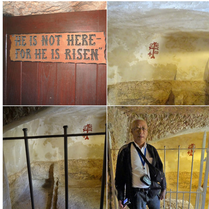
Jesus was here apparently