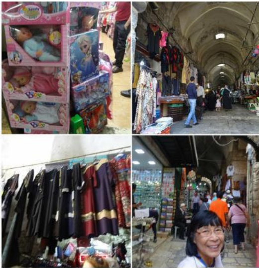
The commercial Via Dolorosa