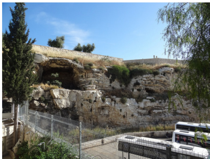
Golgotha, a place of a skull

The Garden Tomb is now a prime tourist attraction. Visible from the Garden Tomb is a geological formation which still does look like a skull to this day, giving credence to the claims of the gospel quotes above. There were tons of tourists when we visited. We had to line up to take a picture of the platform upon which Jesus was supposed to have been laid after having been let down from the cross. There is a sign inside the tomb that reads: "He is not here – for he is risen", as if tourists would expect Jesus to be sitting on the platform greeting guests.