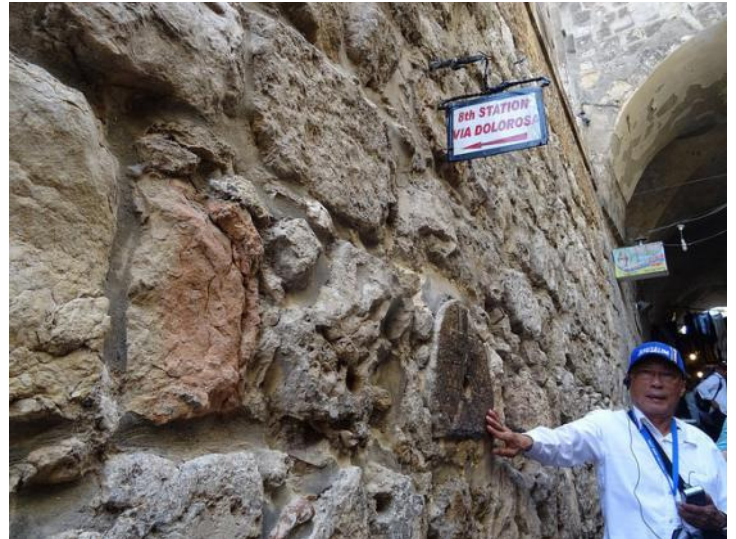
Station 8, Jesus met the women of Jerusalem