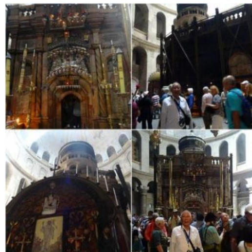
Station 14, Jesus entombed in the Aedicule

Jesus was crucified on a Friday. Question: why is that Friday called "Good" Friday?