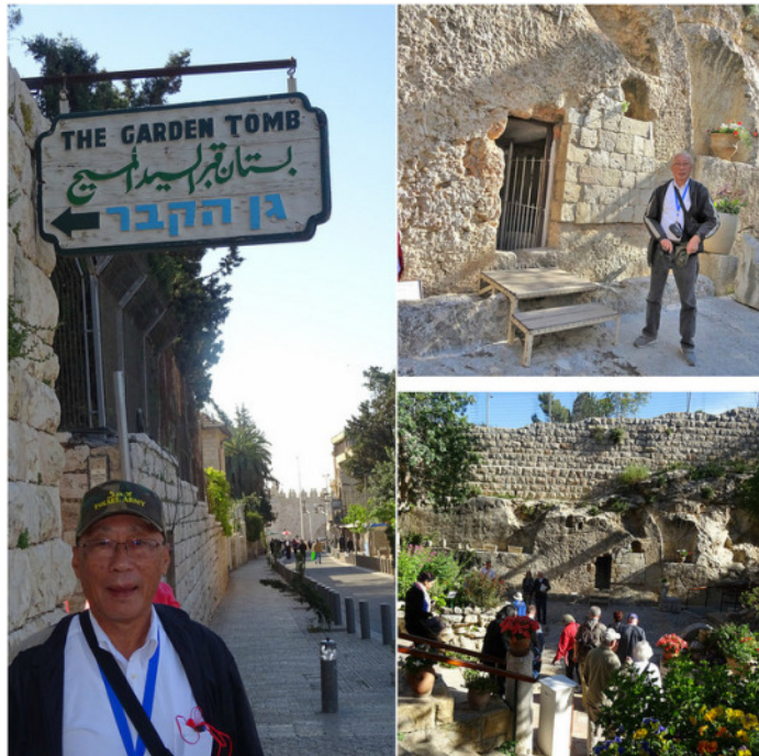
Garden Tomb exterior