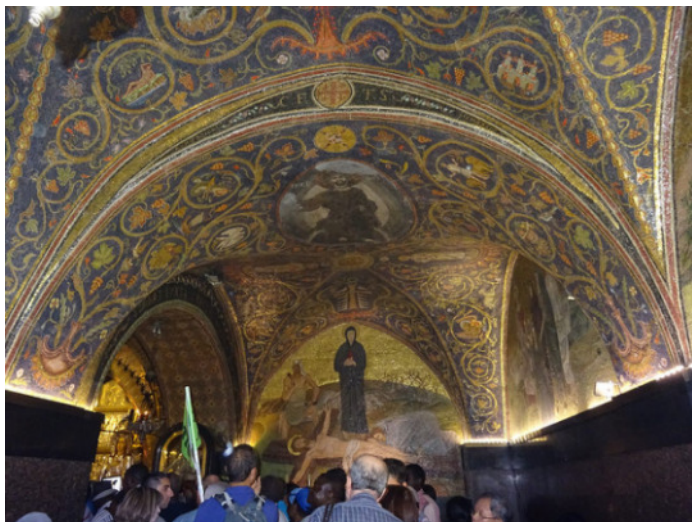
Station 11, crucifixion