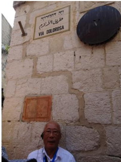
Station 5, where Simon helped Jesus carry the cross