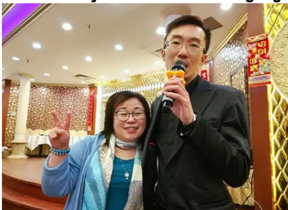
Selfie with joint school friends