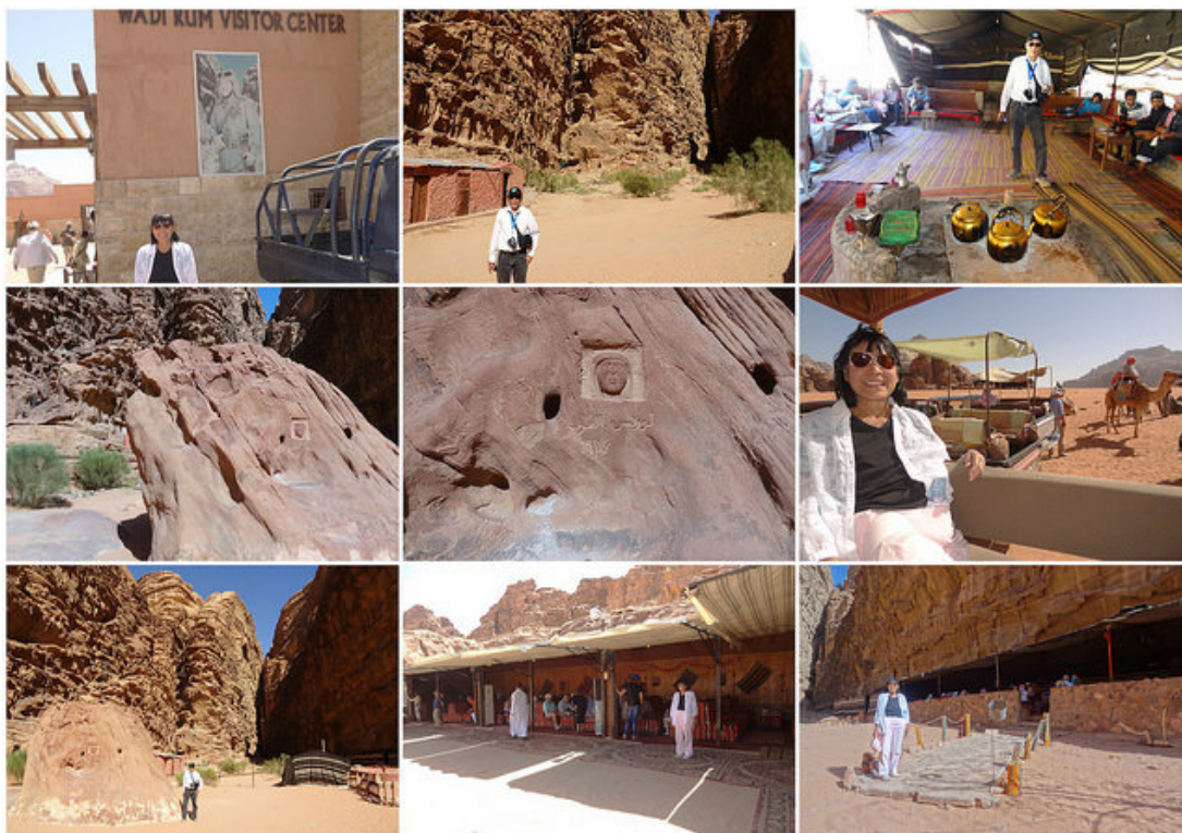
Lawrence of Arabia's former HQ is now a tourist trap. Note his image carved in stone.

Both the actual historical events and some of the movie filming occurred in the areas we visited. The enclave where Lawrence once had his headquarters is now a prime tourist spot, complete with souvenir hawkers.