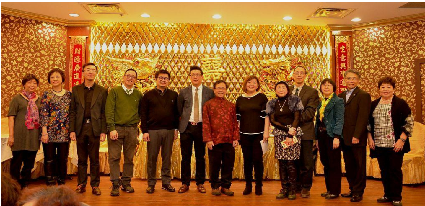
A BIG thank you to the hardworking organizers