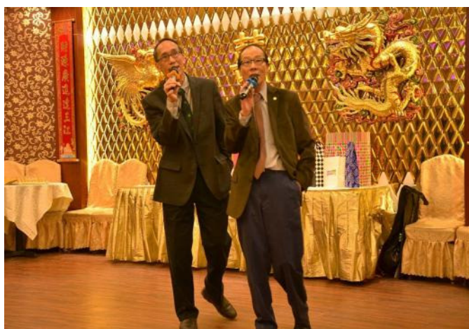
Karaoke and performance....