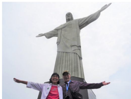
Christ the Redeemer in Rio de Janeiro

Another observation. While Jesus appeared to have died young, I can't help but notice in my travels that images of Jesus as depicted in classical paintings, statues, church stained glass windows etc., mostly show him as a middle-aged or older man. The most striking examples of this misrepresentation are the Shroud of Turin and the Christ the Redeemer statue in Rio de Janeiro, Brazil, both of which give the impression of an elderly Jesus.