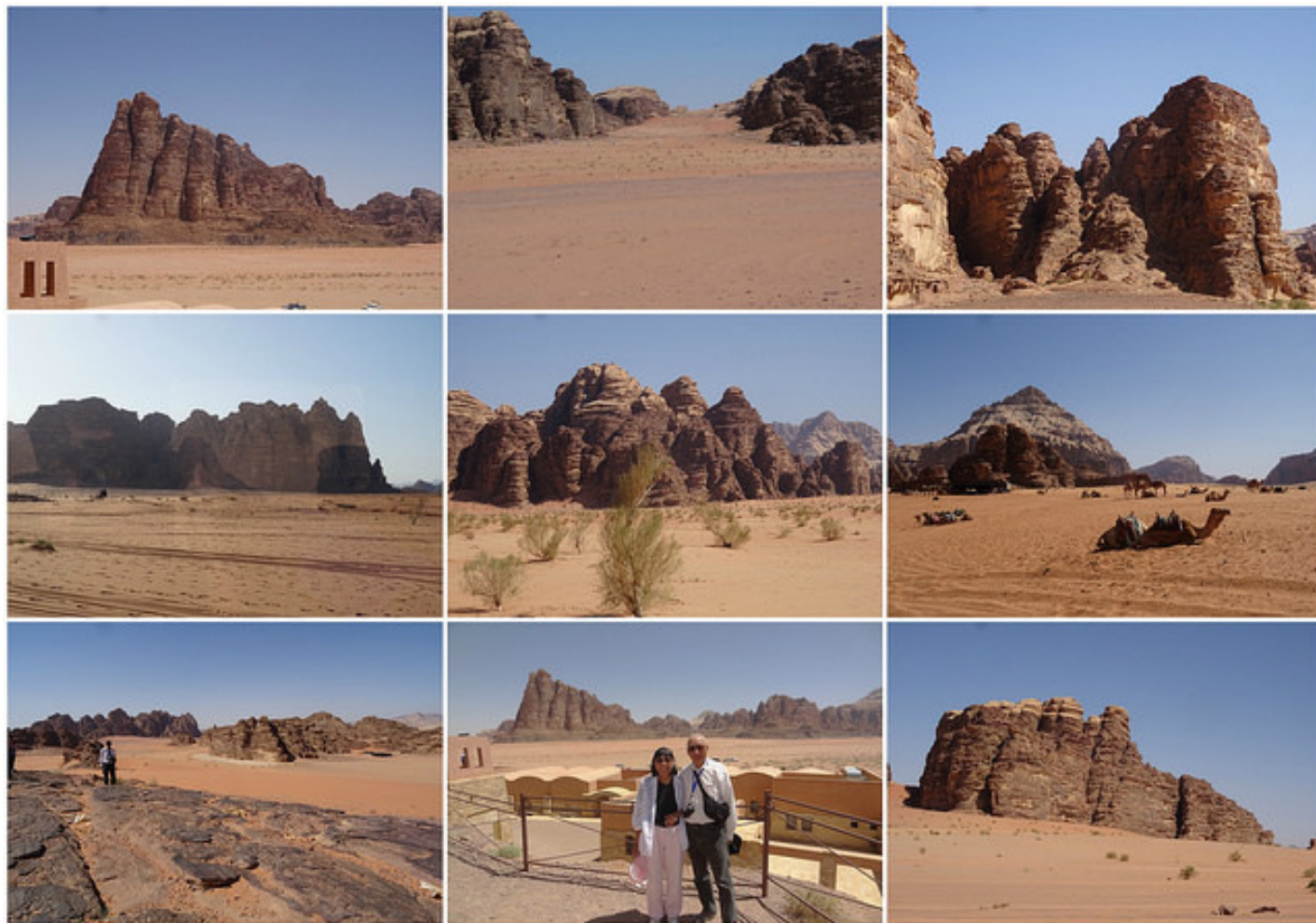
Mars on earth

The other claim to fame for this area is a more recent event also related to a motion picture. The Martian (2015), starring Matt Damon, was filmed here. Some of the terrain is very Mars-like. This area, inhabited by mainly Bedouins, is a prime location for movie-making. A movie was being filmed as we were touring the place.