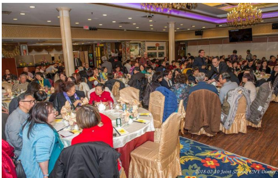
Impressive turnout at the Dinner Banquet