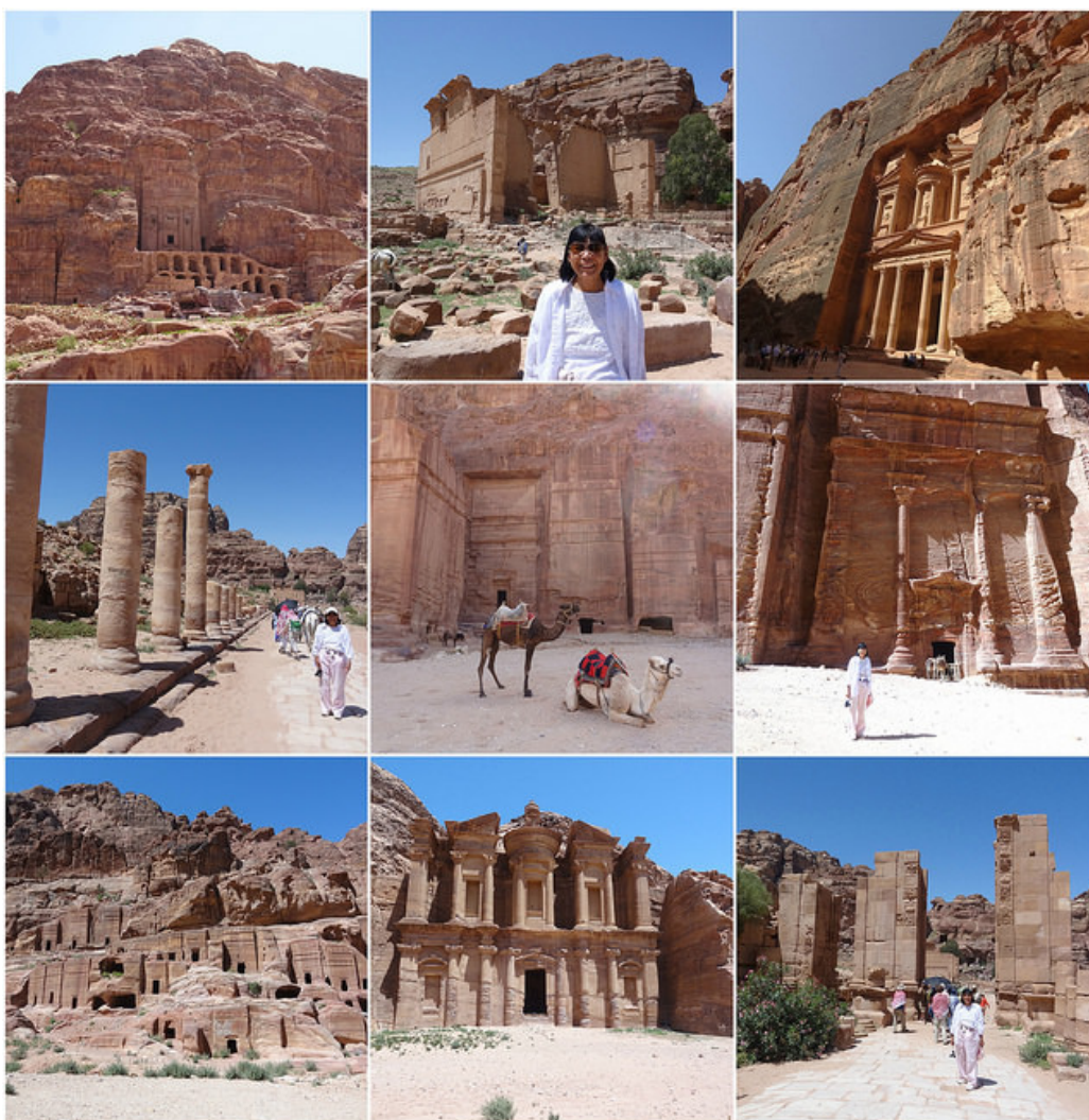
Do you believe these edifices were carved out by hand? Or were there ancient aliens with power tools?

Words cannot do justice to this awe-inspiring site. Enjoy the photos.