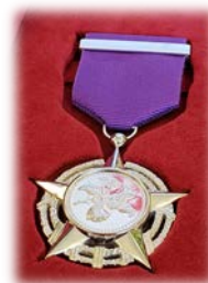
Silver Bauhinia Star Medal (right)