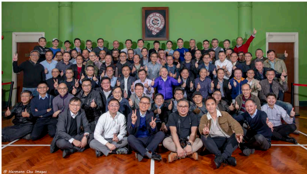
2019 Jan 17 - LSC Class 81' Gathering at Club De Recreio