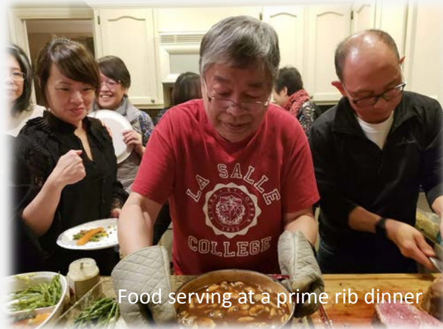
Food serving at a prime rib dinner

Some of the many initiatives taken under Nick's leadership included giving back to the local community through donations and voluntary service, helping grads or continuing students from LSC to settle down in Vancouver and join the chapter, recruiting new board directors, enhancing the LSCOBVAN website and updating its contents regularly, and improving communication both within the board and with the general membership through social media and other means.