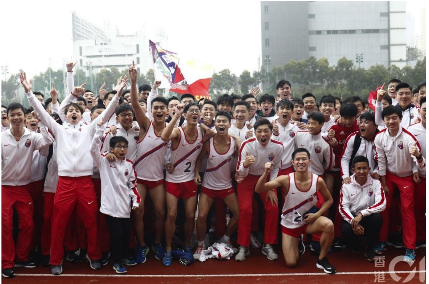
D1 學界田徑：喇沙靠 6 場接力賽反壓男拔，時隔 6 年重奪男子組總冠軍。