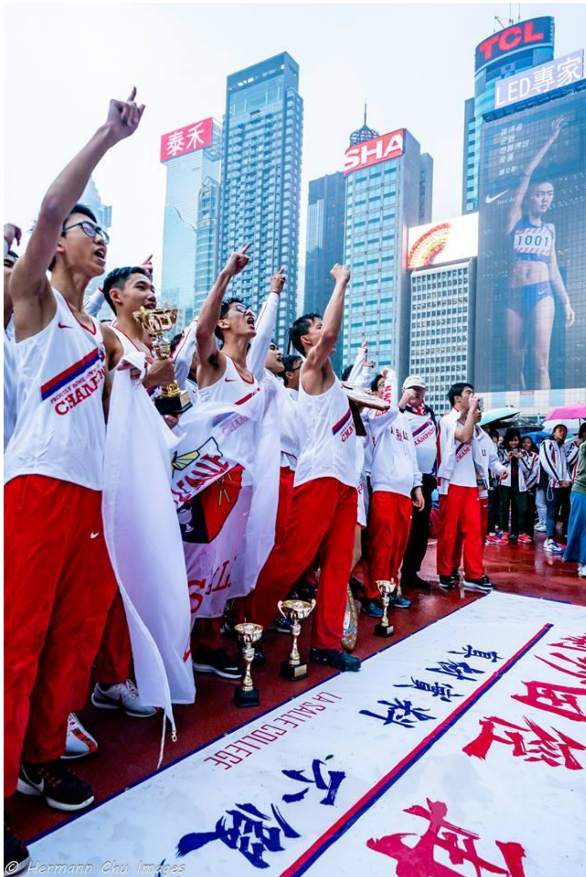
一致的口號 一致的價格觀 一致的吶喊