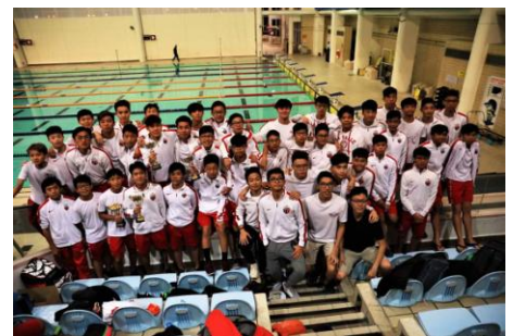
La Salle College Swimming Team (page 12)