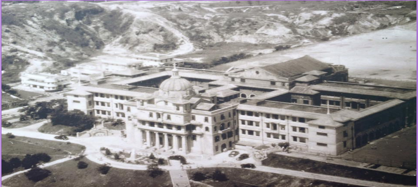
La Salle Texas and Louisiana Tour (page 7)