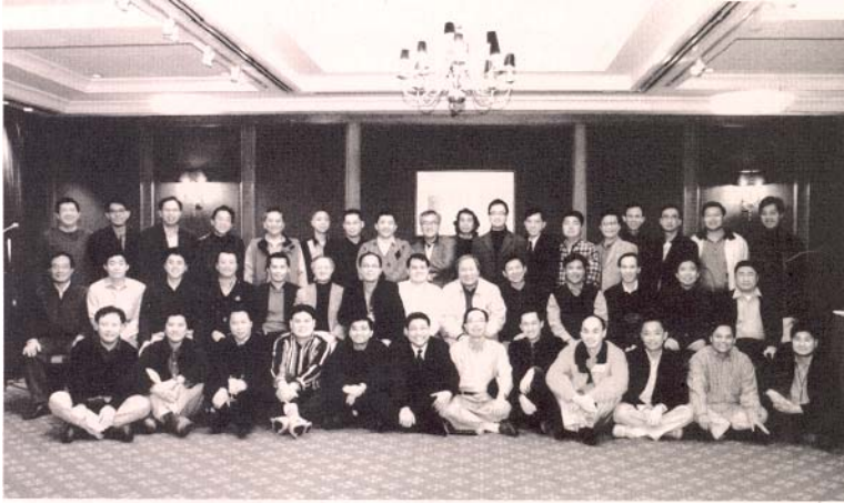
Group Photo of Class 75