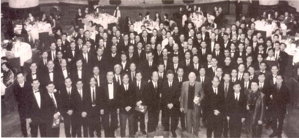
LSCOBA Christmas Ball 2000 Lasallians group Photo