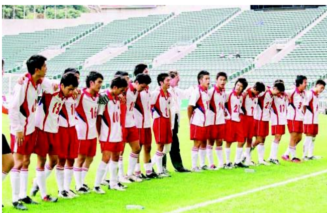
The Jing Ying Football Team proudly sing the School Song to the crowd after the match.