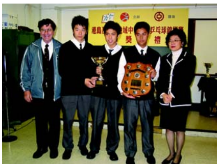
LSC wins the Table-tennis Overall Championship for the 4th time since 2000-01.

captured the Overall Championship in Football. Since 1994 and after 10 years in the wilderness, we have finally restored our pride as the Kingdom of Football. Moreover, our A