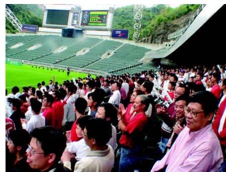
Over 1,000 supporters cheer overwhelmingly regardless the result.

Cheuk Kin (F.3) did the same and gained another maximum 16pt. In addition, our B graders finished 2-3 in shot put and discus; 2nd and 4th in javelin. With this magnificent result, our B grade was just 3pt behind DBS before the last two events - Relay. Unfortunately we could only finish 2nd in 4x100m and 6th in 4x400m and was unable to reap the title. Our C grade suffered the bad luck this year