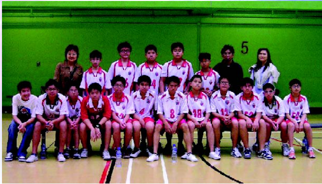
Our Handball Team is going to Div.1 next year!