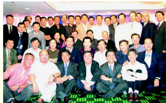
Class of 1978 could be the 'strongest' in the Spring Dinner - See it!