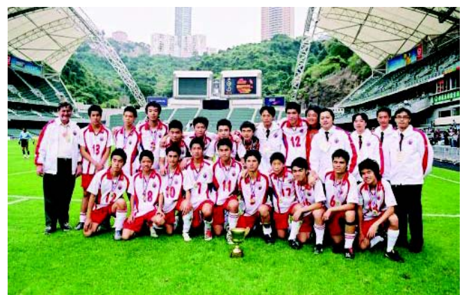
"We will be back" - the Jing Ying boys farewell to the Hong Kong Stadium.

broke the record in the heat. Finally, our juniors had to settle with the third place, lagging 2pt to CGHC. Yes, our arch-rival got the Grand Slam this year but we shall be back.