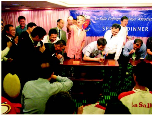
The Spring Dinner reaches its first climax - Beer Drinking Competition with STRAWS.