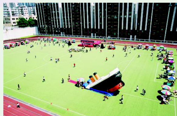
An aerial view of the Lasallian Family Fun Day