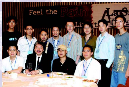
Mr. John Tsang shares his precious moments with his beloved ex-LSC Fencing Team members.