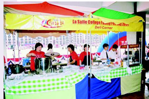
Deli Corner is run by supportive parents