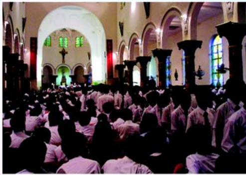
Feast Day Mass of St. John Baptist De La Salle at St. Teresa's Church - 14th May, 2004