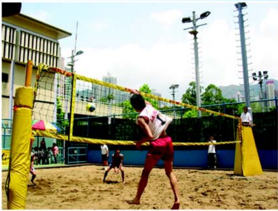
We win the Inter-school Beach Volleyball title outside Choi Hung Road Indoor Games Hall - 1st May, 2004