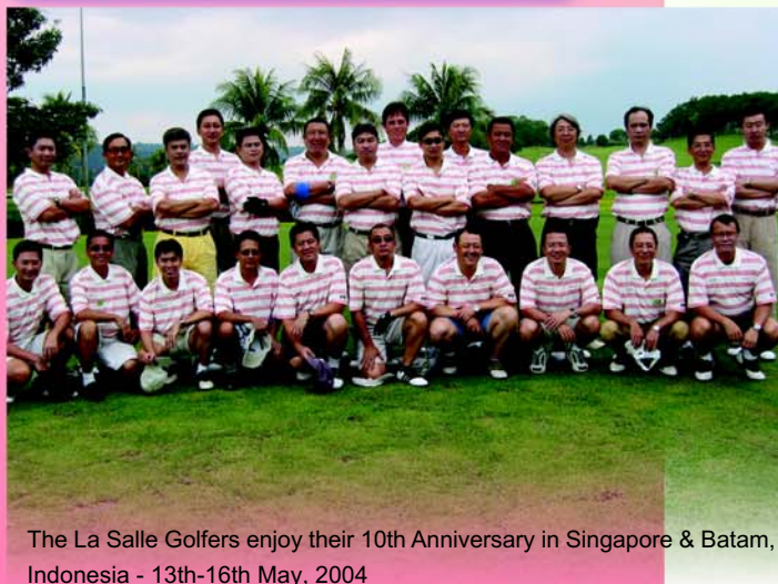
The La Salle Golfers enjoy their 10th Anniversary in Singapore & Batam, Indonesia - 13th-16th May, 2004