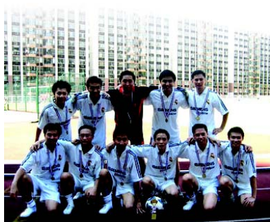
Premier Division Champion – Wu Dang