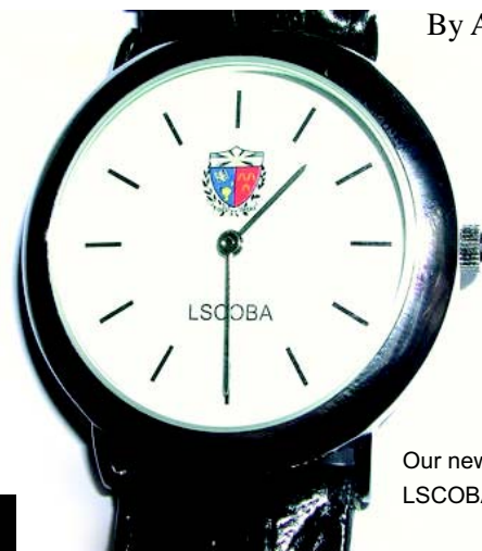
By Anthony Wong (1978)