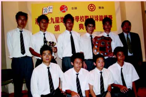
Football Comes Home! LSC is again 2003-04 Inter-school Football Overall Champion (Division I).