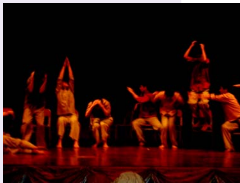
Award winning performance by LSC Dance Team at the School Hall