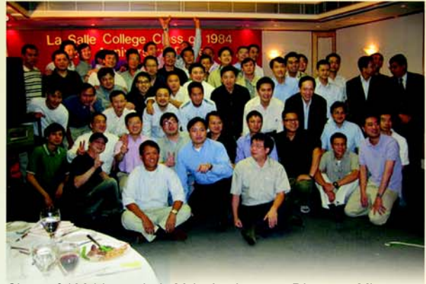
Class of 1984 have their 20th Anniversary Dinner at Miramar Hotel, TST, Kowloon - 15th May, 2004