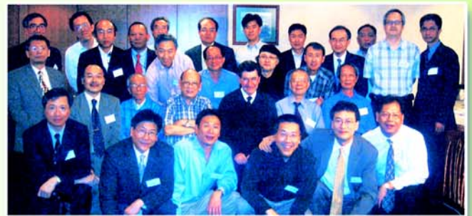
Class of 1969 celebrate their 35th Anniversary - 26th April, 2004