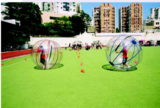
"Megaballs" are popular among the young participants.