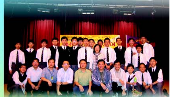
Group photo of community Project in St. James Settlement on 13th November 2004