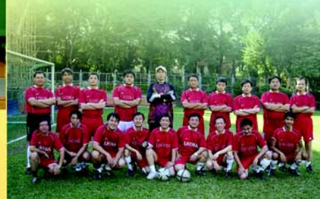
The Reds get together before the match on 28th November 2004 in the Open Day of De La Salle Secondary School