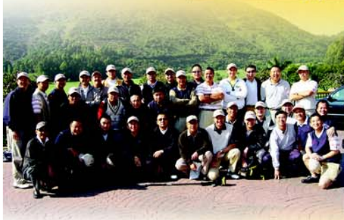
LSCOPA 2004 winter Golf Tournament on 19th November 2004