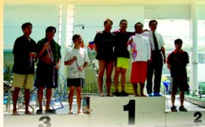
Old boys teams being champion and first runners up in the LSC Swimming Gala