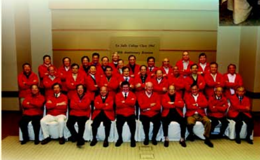
40 th Anniversary reunion of Class 64