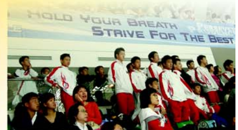
Interschool swimming final