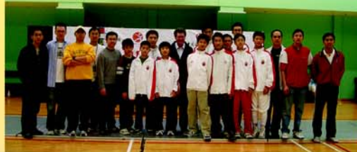
The La Salle Fencing Family 2004-05