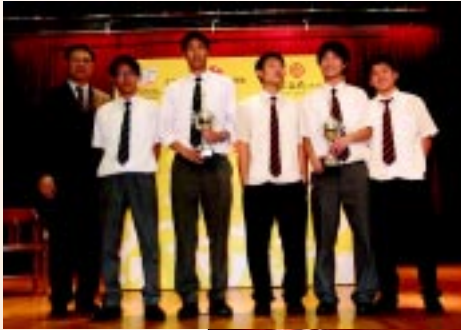
Certainly, we don't want to share the basketball shield with DBS next year. We tie overall 2nd with them - 28th April, 2005