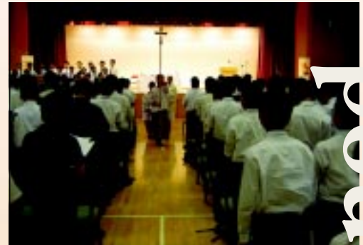
The Feast Day Mass - 13th May, 2005