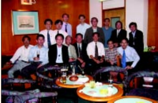
Old Bos enjoy the happy hour at Mariners' Club, T.S.T. Kowloon - 8th June, 2005