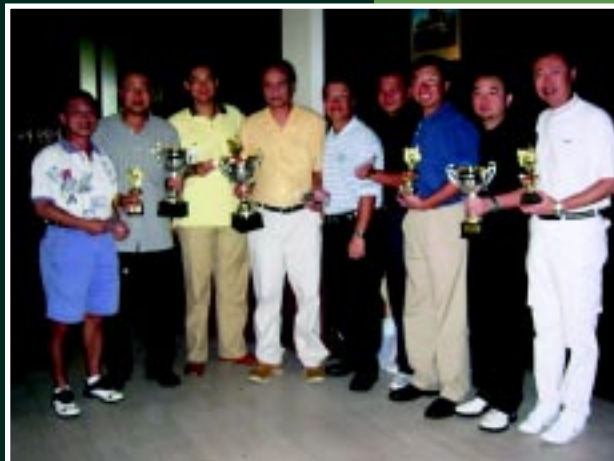
All winners are happy with the results.