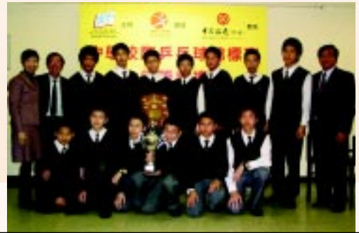
LSC wins the unprecedented 5th Overall Champion in table tennis - 22nd March, 2005