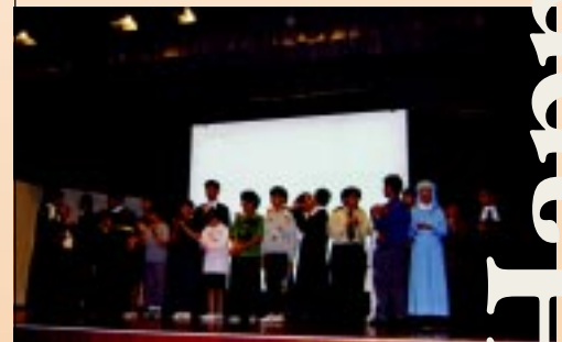
The Founder's Week is held in LSC - 9-13th May, 2005