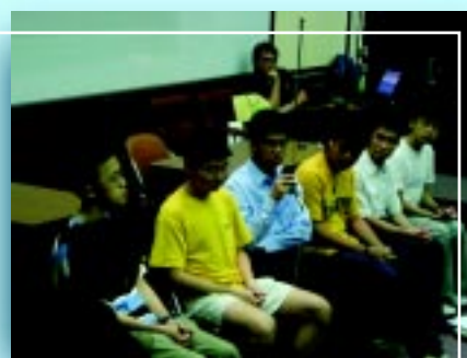
Group Interview for Medical School