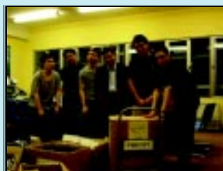
Hard working old boys packing up souvenirs till mid-night!