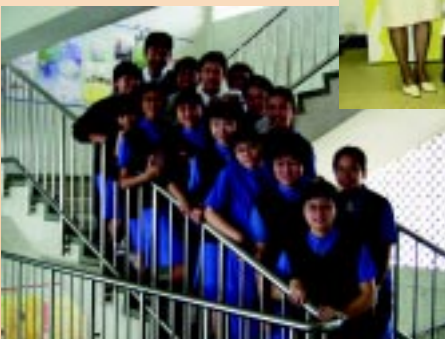
LSC-HYS Exchange Program 18-22 April, 2005