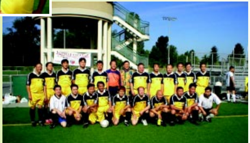
Vancouver Chapter 2005-07