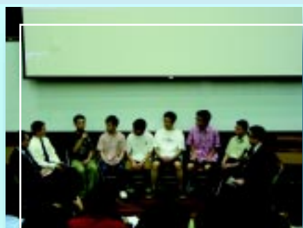
Group Interview for Business School