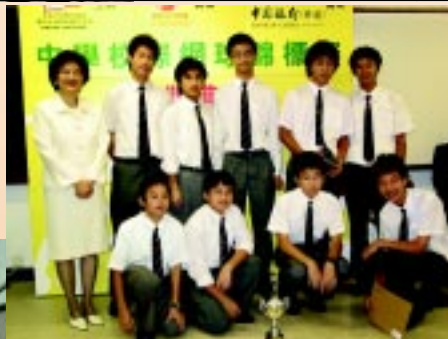
We are overall 2nd again in tennis - 4th May, 2005