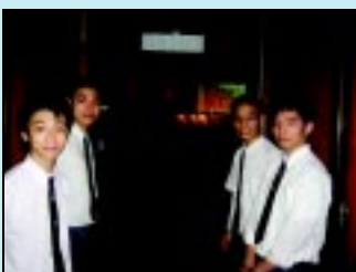
The student helpers welcome the guests.