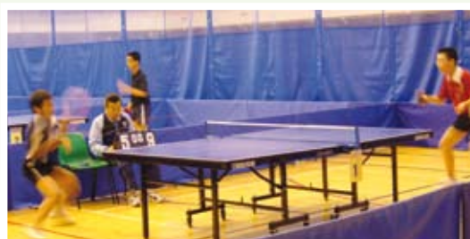
C grade table tennis in action with DBS