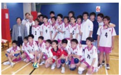
C grade volleyball champion