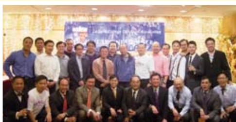
Team Forties and friends at the 2006 Spring Dinner

On the other hand, it is a common joke among the Division One teams that ranking 3rd is more desirable than winning the Championship in Div. 1. Can you find anything better than claiming a piece of silver ware but avoiding promotion?