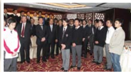
Boys of Courage, boys of Daring...