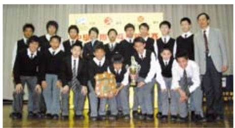
Overall Champions in table tennis for the 6-in-a-row

After the Chinese New Year holidays, the Inter-school sports competitions resumed in full swing. Our C grade table tennis team edged DBS in the Semi- Final and just missed the Grand Slam by losing the C grade championship to Queen's College. At this stage, 3 Bowl points were won since DBS only ranked 4th in table tennis C grade. Unprecedentedly, this was our six-in-a-row Overall Championship in table-tennis. On the next day, our ever-winning squash team beat DBS 7:0 to claim our twelve-in-a-row victory. But the rising of arch-rival team from scratch to 2nd reminds us to improve otherwise a watershed may be around the corner. This year, we ended up with 1 Bowl point advantage only in this event.