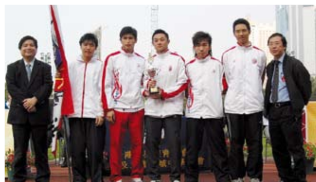
1st Runner-up at Wanchai