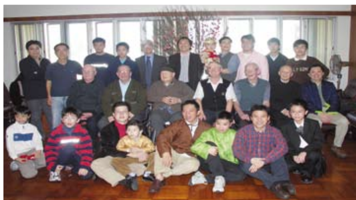
OBA Committee members, family and friends visited the Brothers at 5th floor during the Lunar New Year.

A reasonably coherent and shared morality underpinned the curriculum and when there was a need for discipline, it was reinforced by the values taught at home, and sometimes administered at home as well as at school.