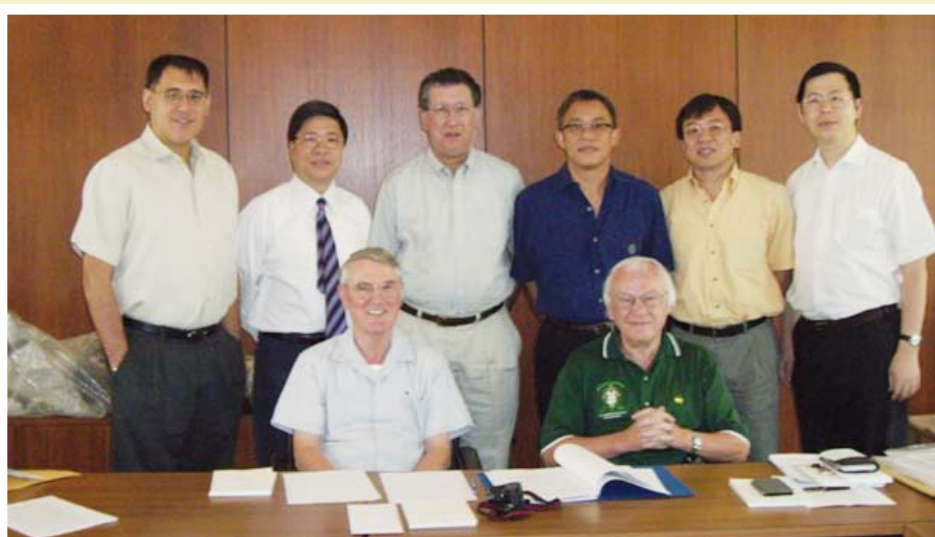
Members of the Lasallian Education Council