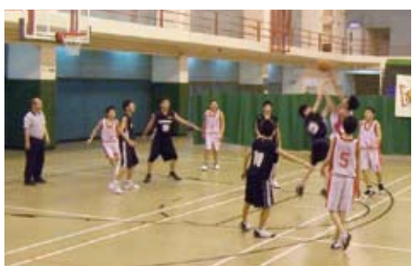
C-grade basketball in action