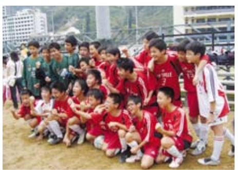
C-Grade football champion