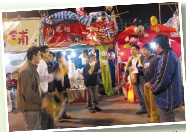
Our boys cheering outside their stall at the Lunar New Year Fair 2006, Fa Hai