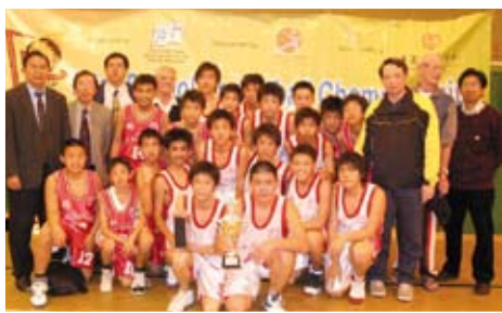
C grade basketball champion