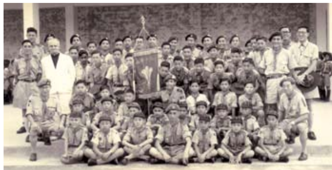
Prince of Wales Banner Award in 1952

All Lasallians must be very familiar with the scout troops of La Salle operating in the name of The 17th Kowloon (La Salle) Group. Many of you, and your sons, joined the cub scouts in the primary school and became scouts and venture scouts in the secondary school. The Group has the longest history dating back since 1937, five years after the establishment of the La Salle College. It was the College's first ever extra-curricular activity which aimed to nurture boys in La Salle to become good citizens. The first investiture was held on 8th July, 1937, with eight boys invested. The total strength gradually increased to about 90.