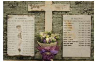
Flowers offered to the deceased Brothers whose remains are laid to rest in Happy Valley, Hong Kong

KC Yuen. We saw a rich display of the history of the school, including old documents, memorabilia, and photographs in a professional and dignified presentation.