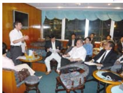
A receptive audience