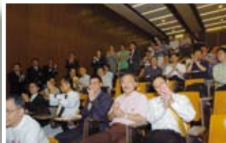
Three cheers for La Salle...