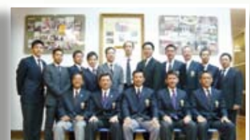
LSCOBA Committee '07-'08