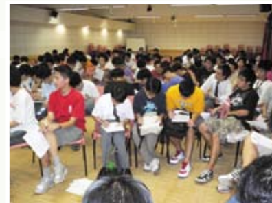
Orientation Camp F.6 students listening in

Organized by the LSC Careers Team, the F.6 O Camp took place in Sai Kung Outdoor Recreation Camp on 7th - 8th Sept. All F.6 students