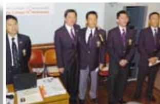
The Presidents and the team singing the School Song