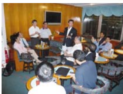
The President introducing the speakers