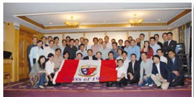
...with their lady guests by the side