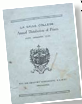
1939 Annual Prize Giving program booklet

There were also several donations of photos from Old Boys. Some of these were donated by Old Boys who took part in the production of Lasallites (year book) or other school publications, and for many years the originals photos were inadvertently left at home! We had three such donations, including one presumed-lost original photo from 1930 of the construction of old LSC and several unseen photos of the Brothers and school life. So, Old Boys out there, please check your storage boxes!