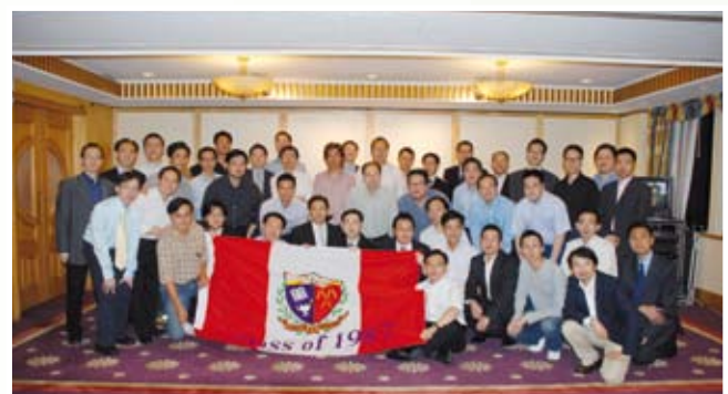
When the 87'ers get together...