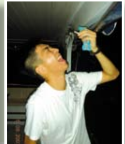
My favorite "Squid sashimi?!"