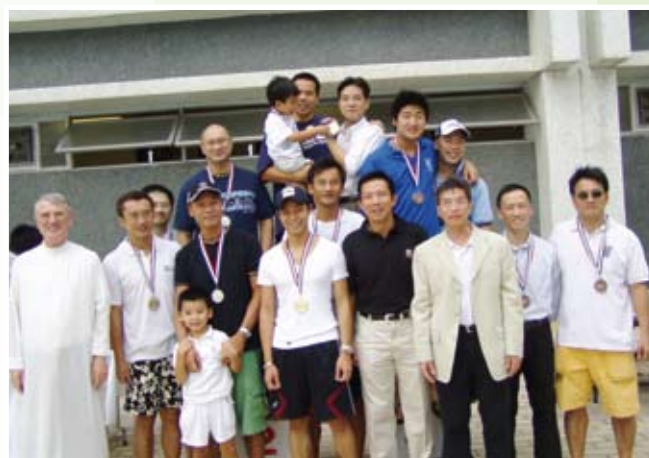
Winners of 2007 Old Boys Race

When the Old Boys get together, they will always ..... have fun before singing the school song. A record breaking number of Old Boys spanning across 4 decades came back to compete in the Old Boys race of the LSC Annual Swimming Gala on 28 September. Four relay teams were formed and the teams were not only made up of elite swimmers from the pasts, but also stars in various sports such as Tennis; Track & Field; Fencing; Basketball; Volleyball; Orienteering ... etc. We all had a great time and some of us even brought our family to share the joy. But when race time came, the competitiveness of La Salle Spirit soared within every one of us and gave all we had to compete. It was a very competitive race and team "The Late 80s" came from behind and took the Gold with a record time of 2'05" breaking the old mark set by the 70ers a couple of years ago 2'08". The Silver was snatched by team "the Sixers", also coming from behind just beating team "Young & Young at heart" to the wall. The once mighty team "The 70s" tried to stay close with the young teams and won the hearts of all spectators.