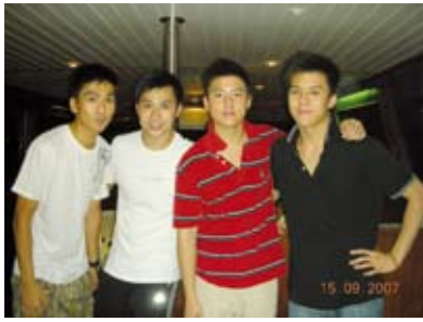
Young Old Boys and friends