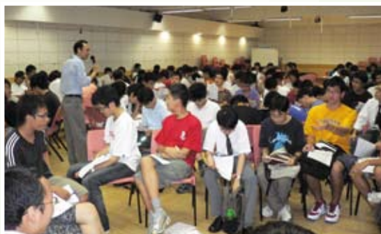
Speech to students at the Orientation Camp

This was a program for the F.1 students and their parents held on 11 Aug. The OBA set up a booth to promote the LSCOBA credit card to the parents. Many submitted their applications on the spot when they heard about how the School will benefit from their application ($150 cash donation to OBA by the card issuer) as well as their credit card spending (cash rebate of 0.3% to OBA).