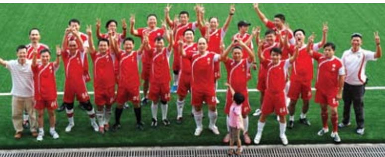
All wearing #84 jersey; everyone was a winner