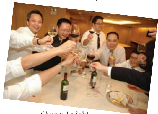
Cheers to La Salle!