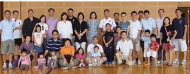
Visiting the new LSPS campus with the little ones