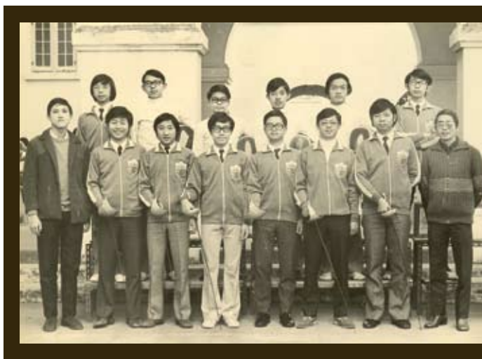
Fencing Team photo in the mid 1970s.