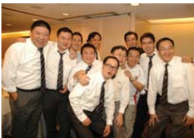
Still the same guys after a quarter of a century