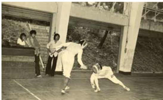
A friendly fencing match with DBS in the 1970s, LSC fencer on the right.

"If you still don't know by now that fencing is at best a stepson of La Salle's sports league, learn it by heart. We were and are not qualified for the family estate! There are a few good reasons for this: